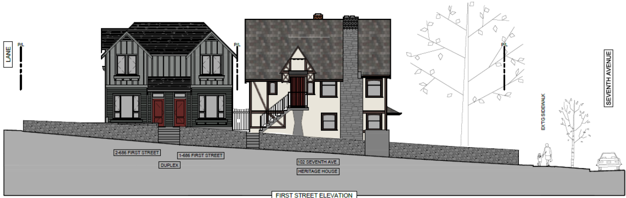
Figure 4: Proposed duplex as seen from First Street

To the south of the heritage house, a new stratified, two-storey, side-by-side infill duplex would be built fronting First Street. The duplex units would be roughly 1,025 sq. ft. (95.2 sq. m.) each and contain two bedrooms. These units would be built to Step Code Level 3. Rear yards proposed along the west of the site meet the related open space guidelines. The duplex would be designed as a contemporary and understated interpretation of tudor revival, with a restrained colour palate and detailing, as shown in the proposed First Street elevation below.