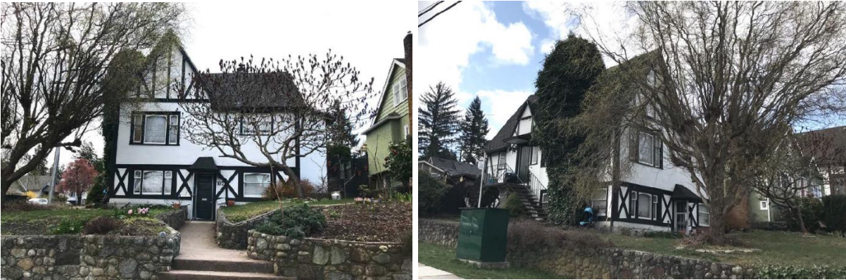
Figure 2: Photographs of the house from Seventh Ave (left) and First St (right)

Further review of the heritage value of the house and any conservation work proposed would be conducted by the Community Heritage Commission, should the application proceed in the development review process. The conservation work proposed would also be evaluated against the Standards and Guidelines for the Conservation of Historic Places in Canada .