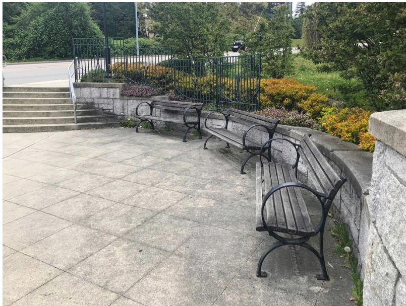
Photo A-16: 2005/06-constructed plaza. Note: Iron fencing and granite block walls here are not historical.