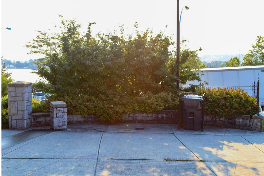
Photo A-15: 2005/06-constructed plaza with terminus of Woodlands Wall on right.