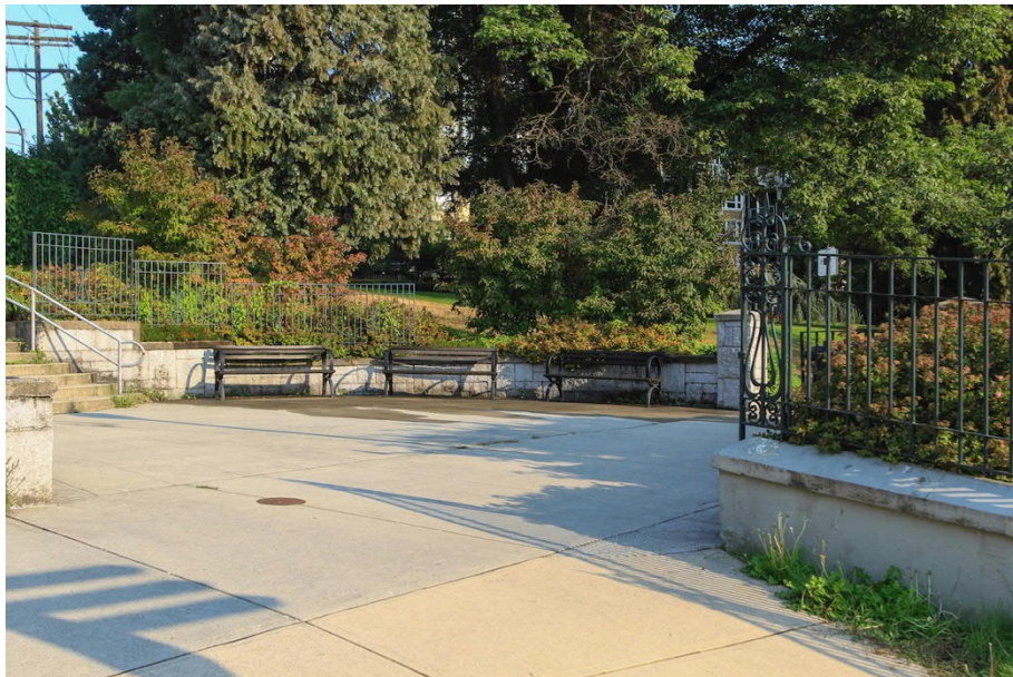
Photo A-10: 2005/06-constructed plaza at terminus of Woodlands Wall.