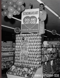
"A Strongheart brand dog and cat food display in a Super-Valu store that is also a promotion for CKNW's Fiesta contest" March 1955