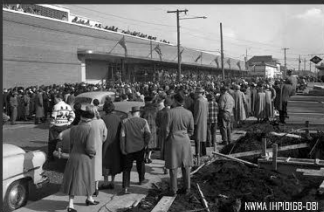
"Opening of the Woodward's in New Westminster" March 1954