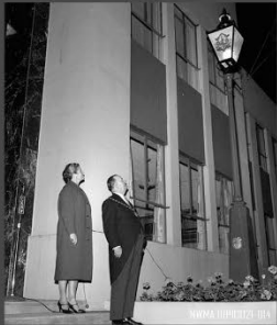
"Mayor of Westminster, England (Gordon Pirie) and Mayor of New Westminster (Beth Wood) admire the illuminated lamp standards at City Hall. Two light standards were gifted to the City of New Westminster in honour of the City's Centennial." May 4, 1960

Croton was a commercial photography firm whose biggest clients were the City of New Westminster, CKNW Radio Station and The Vancouver Sun.