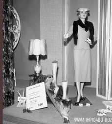
"The Woodward's window display" c. 1950