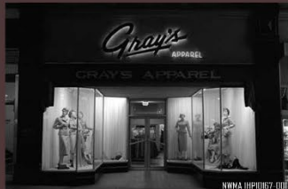
"The exterior of Gray's Apparel, 612 Columbia Street, c1950s"

"Butler Tire race car on Auckland St at 131 Twelfth St." 1950