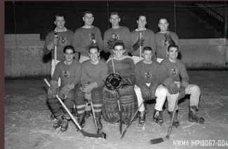
"Hockey team posed on the ice at the Queens Park Arena" February 10, 1960

"Men posed behind a large spar of lumber to be loaded on a freighter and sent to England as part of the Mayflower replication project celebrating its 400 year anniversary." February 1956