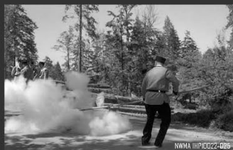
"Firing of the Anvil salute in Queen's Park" July 1960