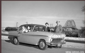
"Trap Motors car in front of the Patullo Bridge" March 12, 1958