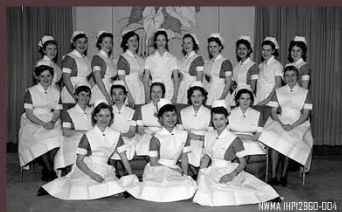
"Capping class from Royal Columbian Hospital" January 30, 1958