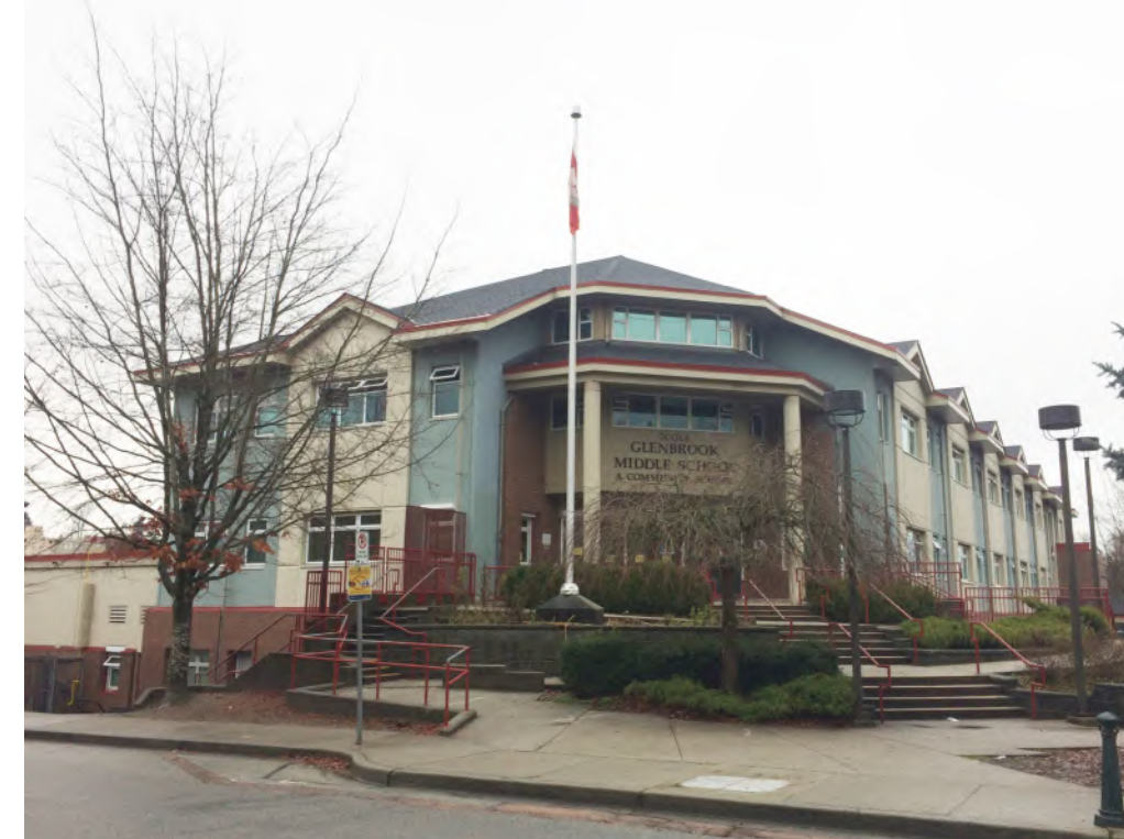
Ecole Glenbrook Middle School