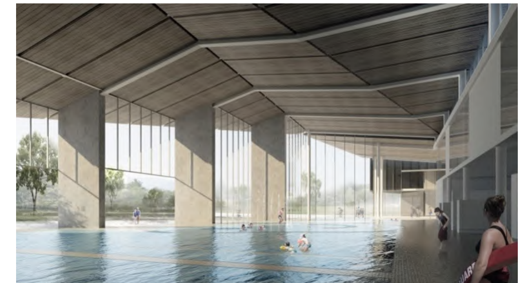
New Westminster Aquatic and Community Centre