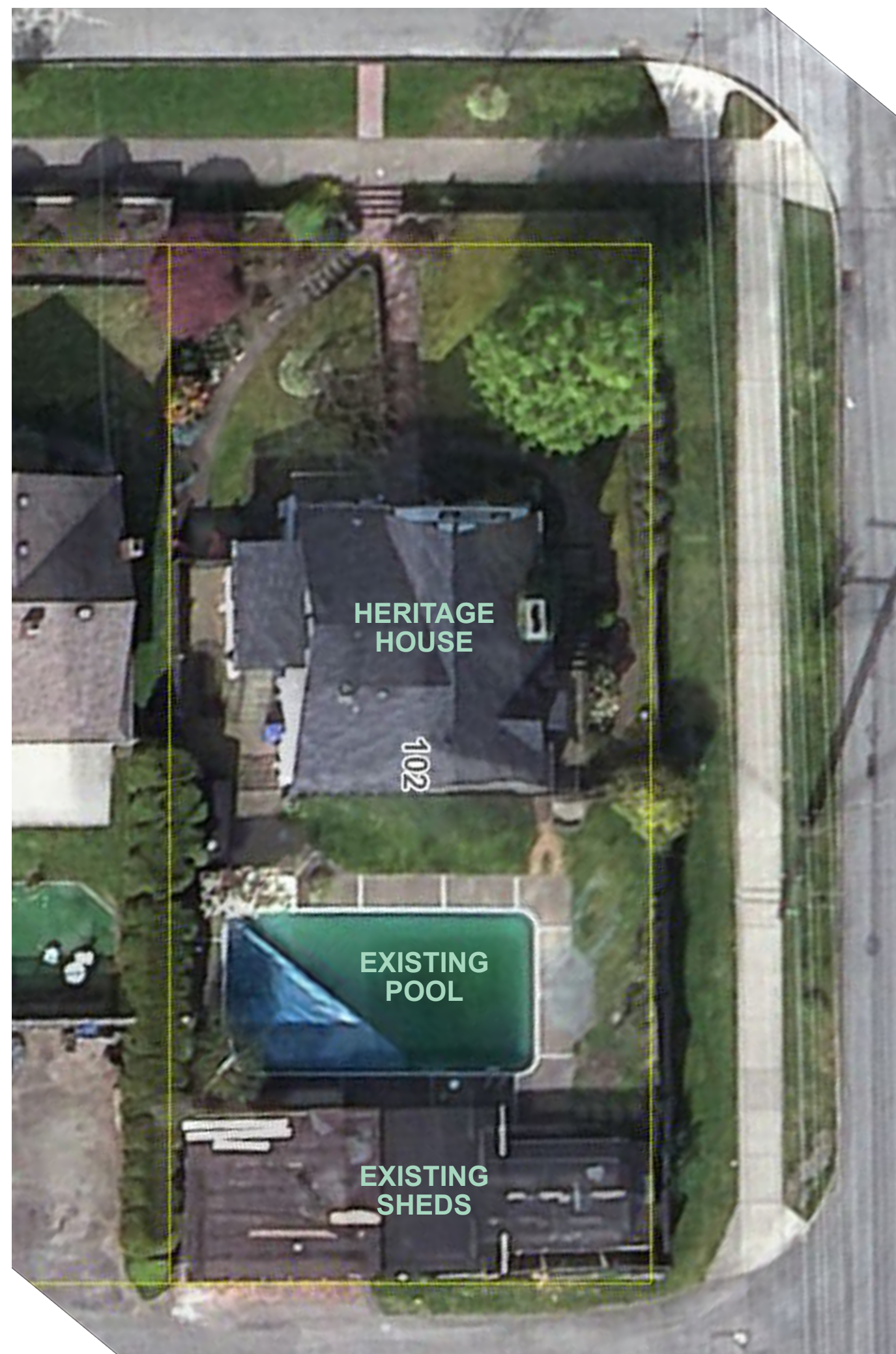
AERIAL PHOTOGRAPH OF EXISTING LOT CONDITION