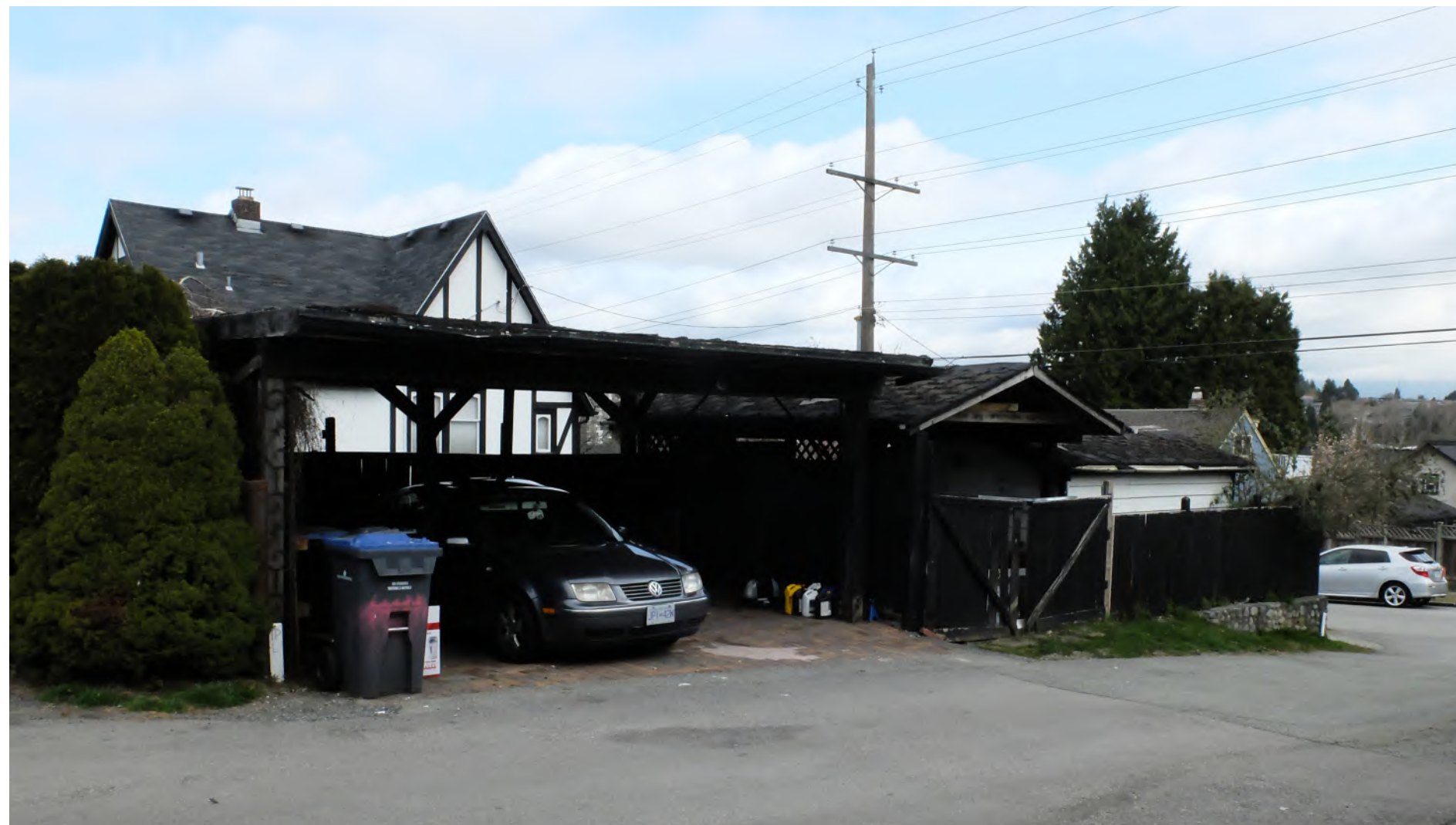
SHEDS AT LANE TO BE REPLACED WITH OPEN PARKING