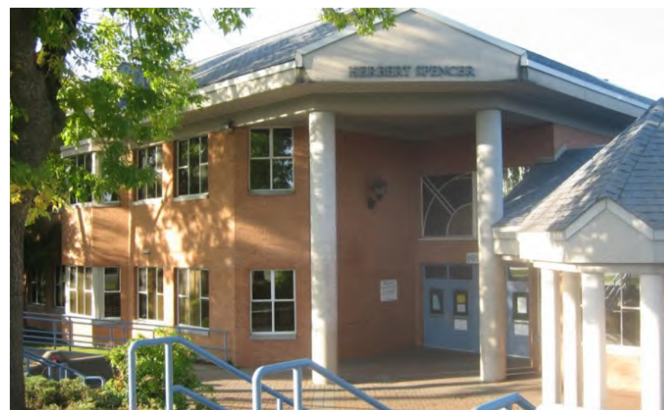
Ecole Herbert Spencer Elementary School