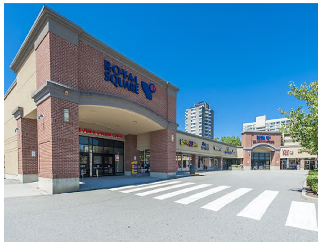
Royal Square Mall