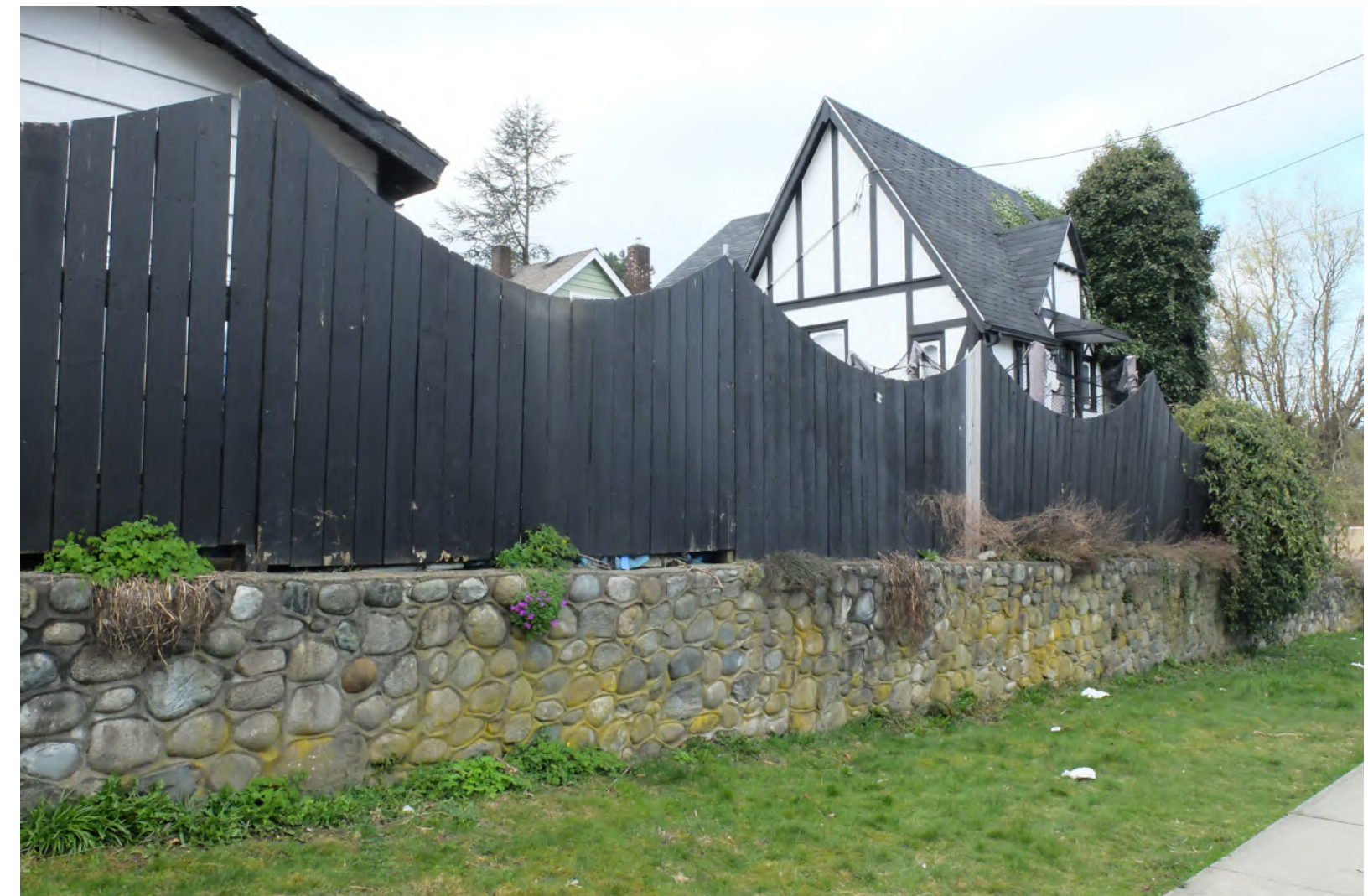
CURRENT VIEW NORTH FROM FIRST STREET