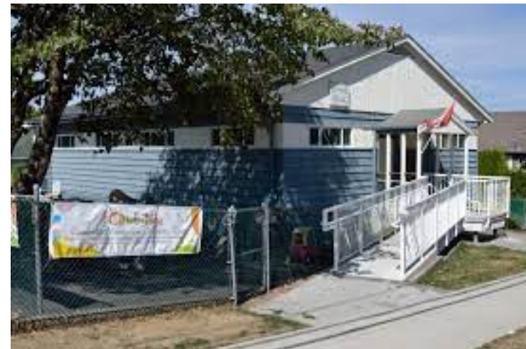
Cambridge Montessori (daycare)