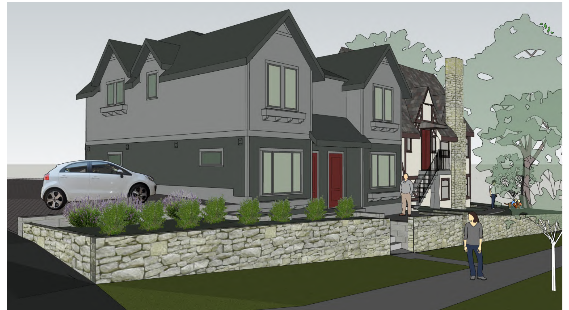
PROPOSED VIEW NORTH FROM FIRST STREET

Heritage Revitalization Agreement for 102 Seventh Avenue