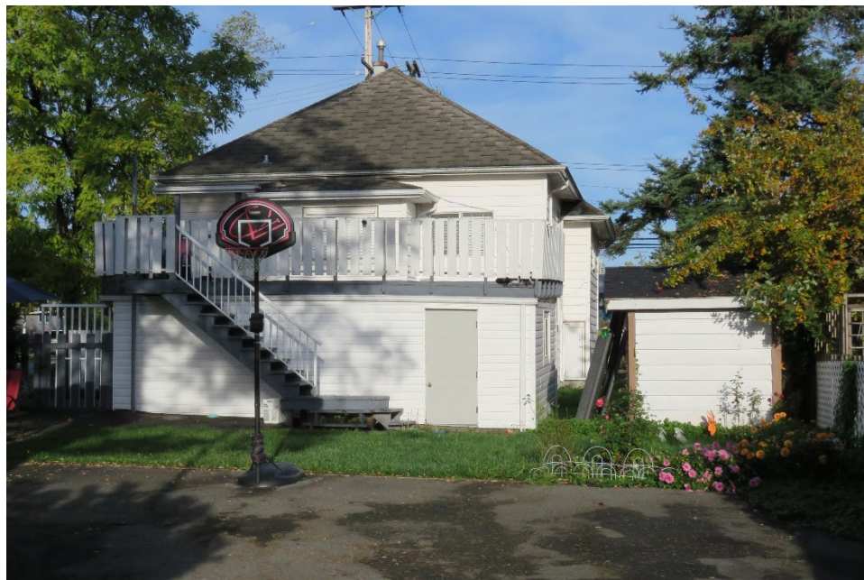
South (Rear) Elevation