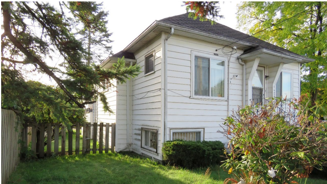
East (Side) Elevation