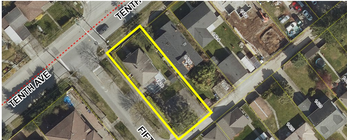
Map Courtesy of City Views (CNW) V. 3.0

The property is shown on the following maps, outlined in yellow. It is located in the West End neighbourhood, on the south 4 side of Tenth Avenue, at the corner of Tenth Avenue and Fifteenth Street. To either side and across the street are other single-family houses that were constructed in various time periods.