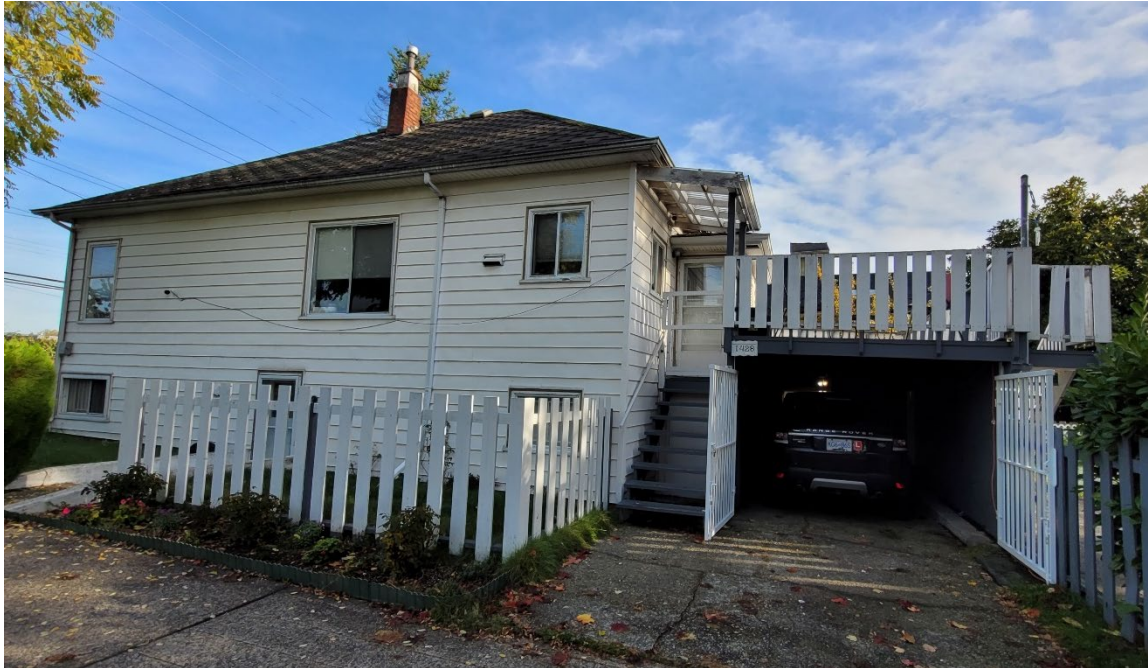
West (Side) Elevation