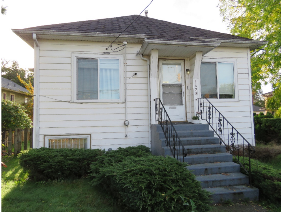
North (Front) Elevation