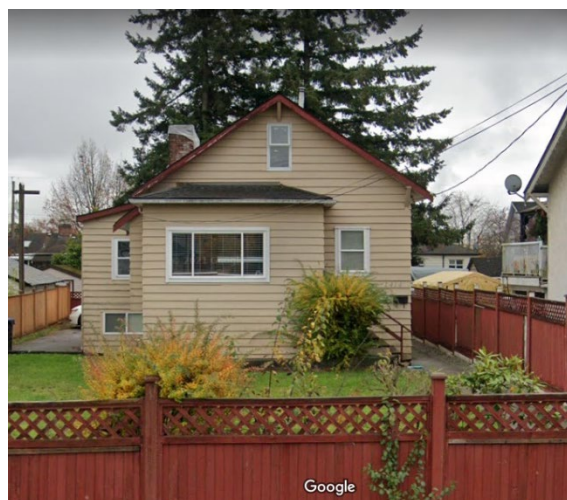
Screen Shot of 1414 Tenth St from Google Maps, 2021

There are no on-line marriage or death records available for any of the above people. In order to discover if there is more information about any of these owners, more time than is available for the writing of a Heritage Assessment would be required.