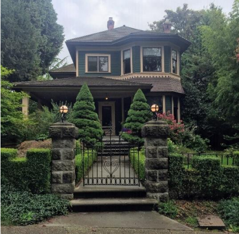
Figure 2: Recent photograph of 125 Third Street

as well as for its association with celebrated local architects and craftspeople, such as Clow & Welsh (architects), Gardiner & Mercer (architects), and Henry Bloomfield (stained glass manufacturer). Further information is found in the Statement of Significance (Attachment 3). Historic and current photos are in Attachment 4. The house is also pictured below: