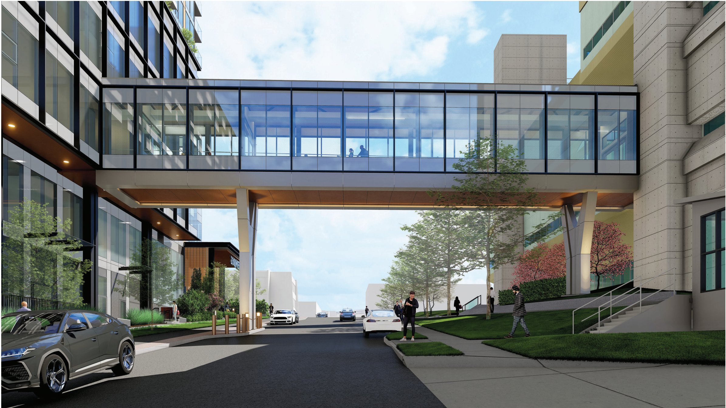
RCH BRIDGE - VIEW FROM THE EAST SIDE ON KEARY STREET