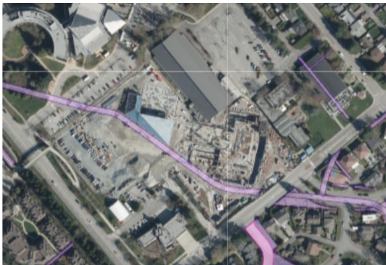
Figure 1: The Existing Statutory Right of Way

In December 2018, the City of New Westminster began discussions with the Greater Vancouver Sewerage & Drainage District regarding the replacement of the Canada Games Pool and Centennial Community Centre with a new aquatic and community centre at 65 East Sixth Avenue. The project impacts an existing statutory right of way (SRW) held by Metro Vancouver on the land, registered under instrument BL61579, which protects the Glenbrook Combined Trunk Sewer Facility (a 1950 mm diameter combined sewer). The SRW is essential for the operation, maintenance, and protection of this sewer facility.