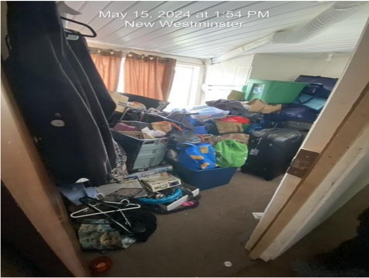
Photo 13- ground level unit 3 (back of home) image of bedroom - occupied