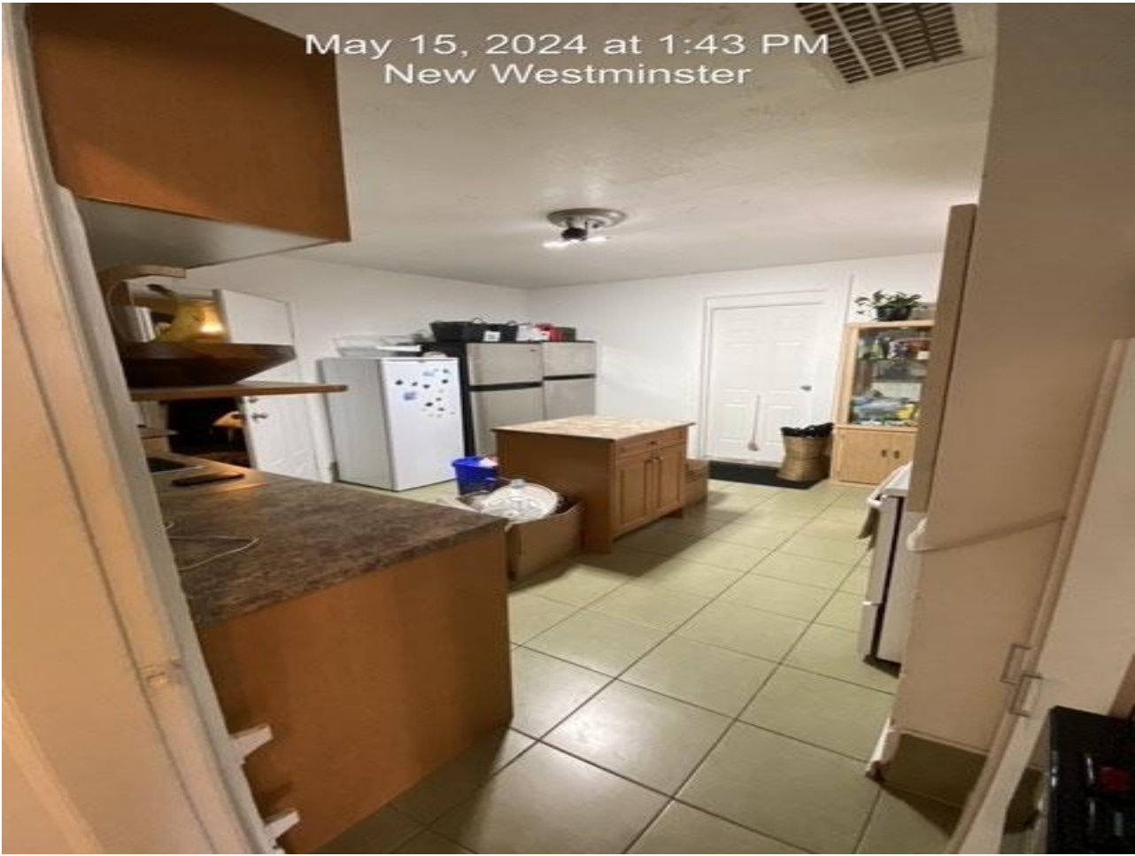
Photo 8 – Photo of ground floor kitchen with entry from front of home