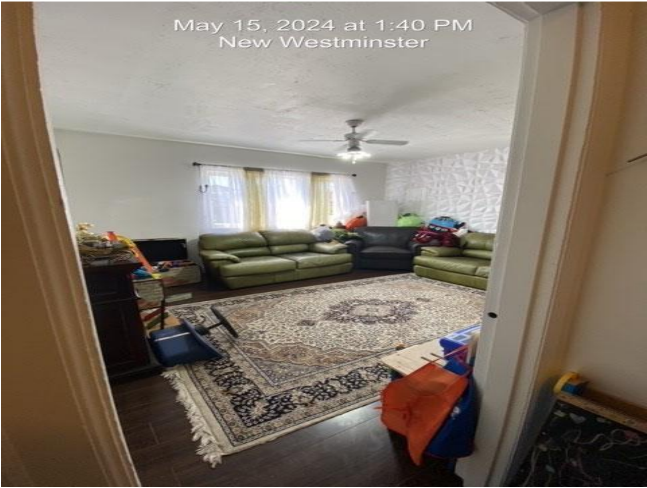
Photo 3 – main floor of home, the wall between the living room and play room has been removed.