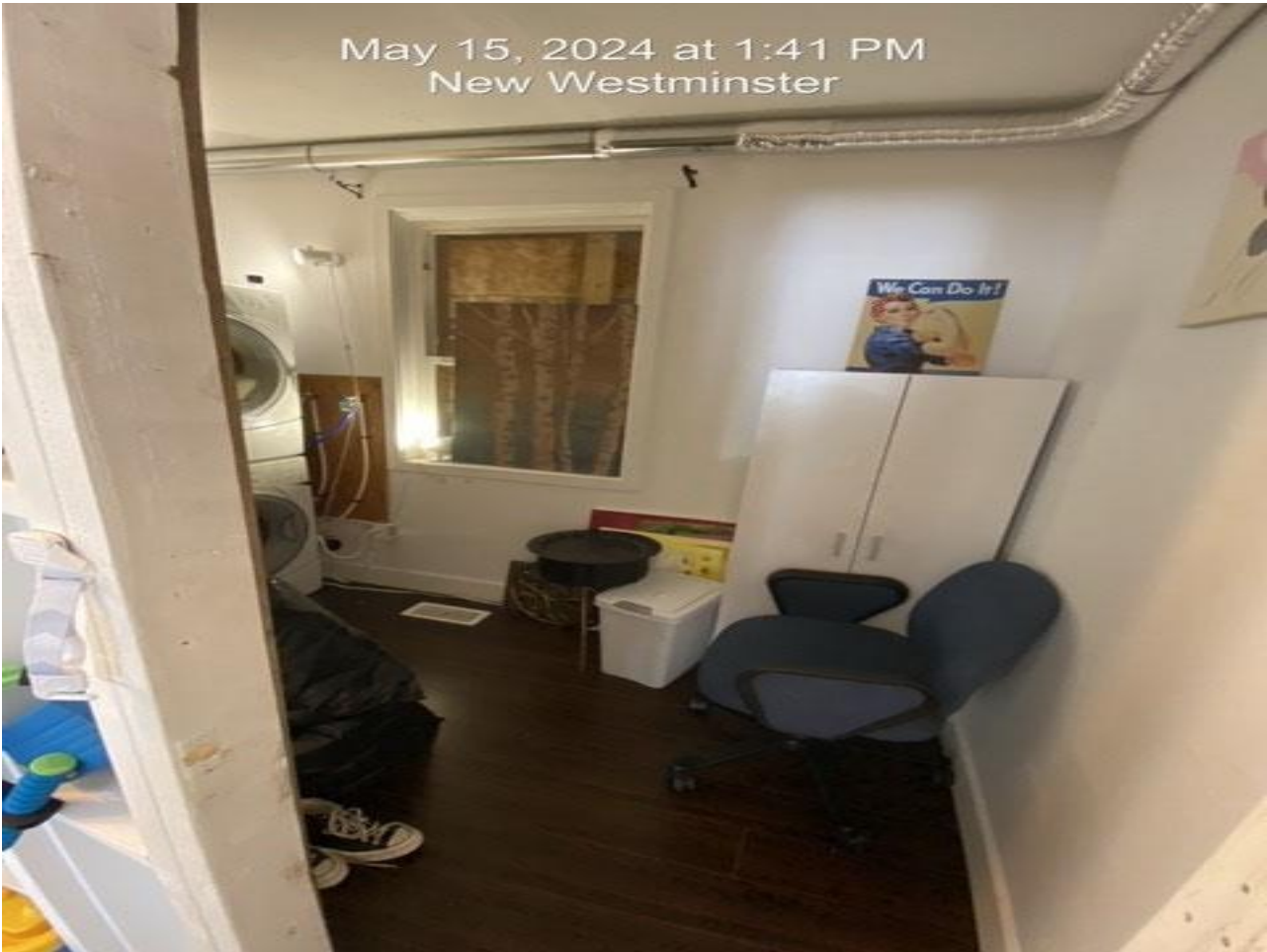
Photo 6- image of laundry room on the main floor. The wall separating the play room and the laundry room is a temporary wall and the window is covered with plywood. Unit 4 is on the other side of the window.