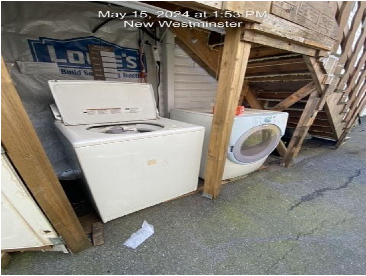
Photo 12 – Image of ground level unit 3 (back of home) – storage room