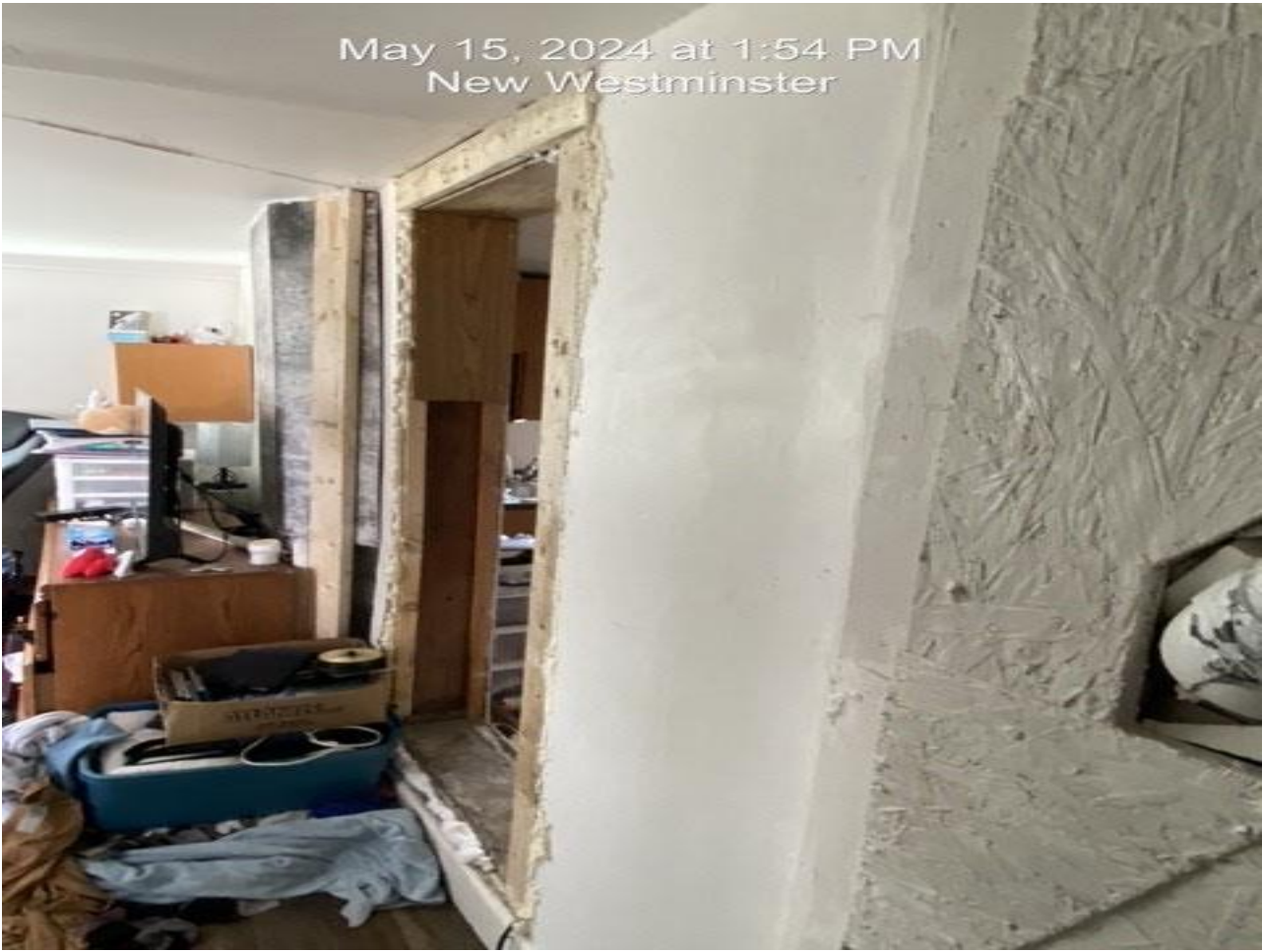
Photo 14 – image of kitchen for unit 3 ground level (rear of home)