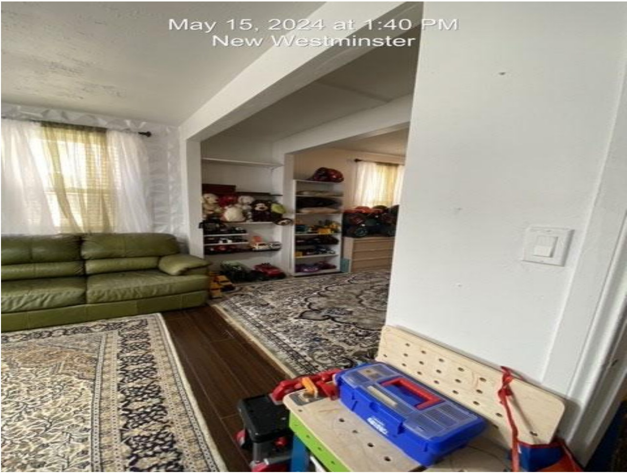
Photo 5 – Image of laundry room on the main floor past the play room area