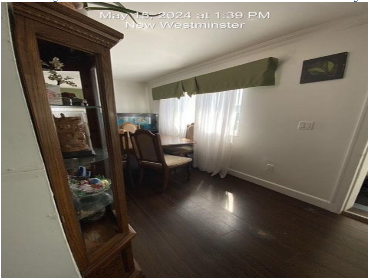
Photo 2 – image of front room on main level. Was a room but now a living space

Photo 1 – Image of main floor. The wall has been removed and the room is converted to a dining room