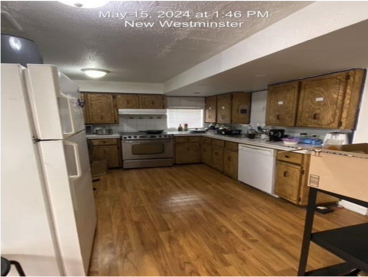
Photo 9 – once vacant room 1B at ground level of home. Occupied by male from main floor