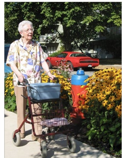
Walking routes need to be accessible for people with walkers and scooters.

The OCP includes Development Permit Areas with guidelines to address how buildings combine with streets and public spaces to create unique, attractive places that fit and include accessibility. Additionally, it speaks to the partnership and collaboration with TransLink to provide accessible and complete public transportation networks.