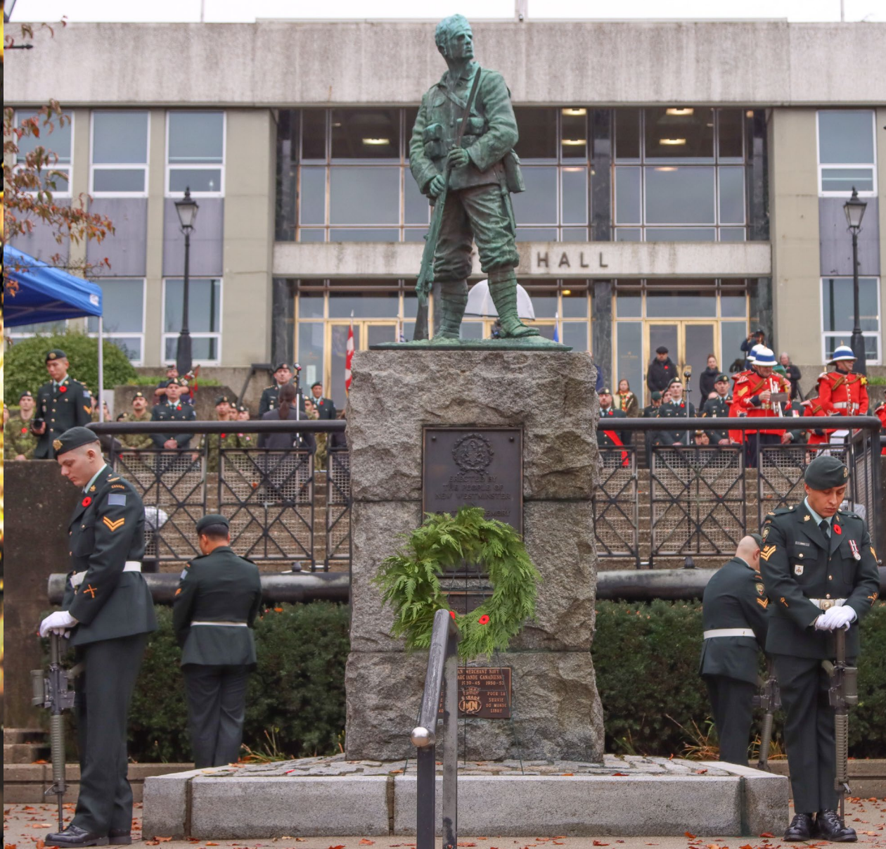
Category A: City-led events that strengthen a collective identity