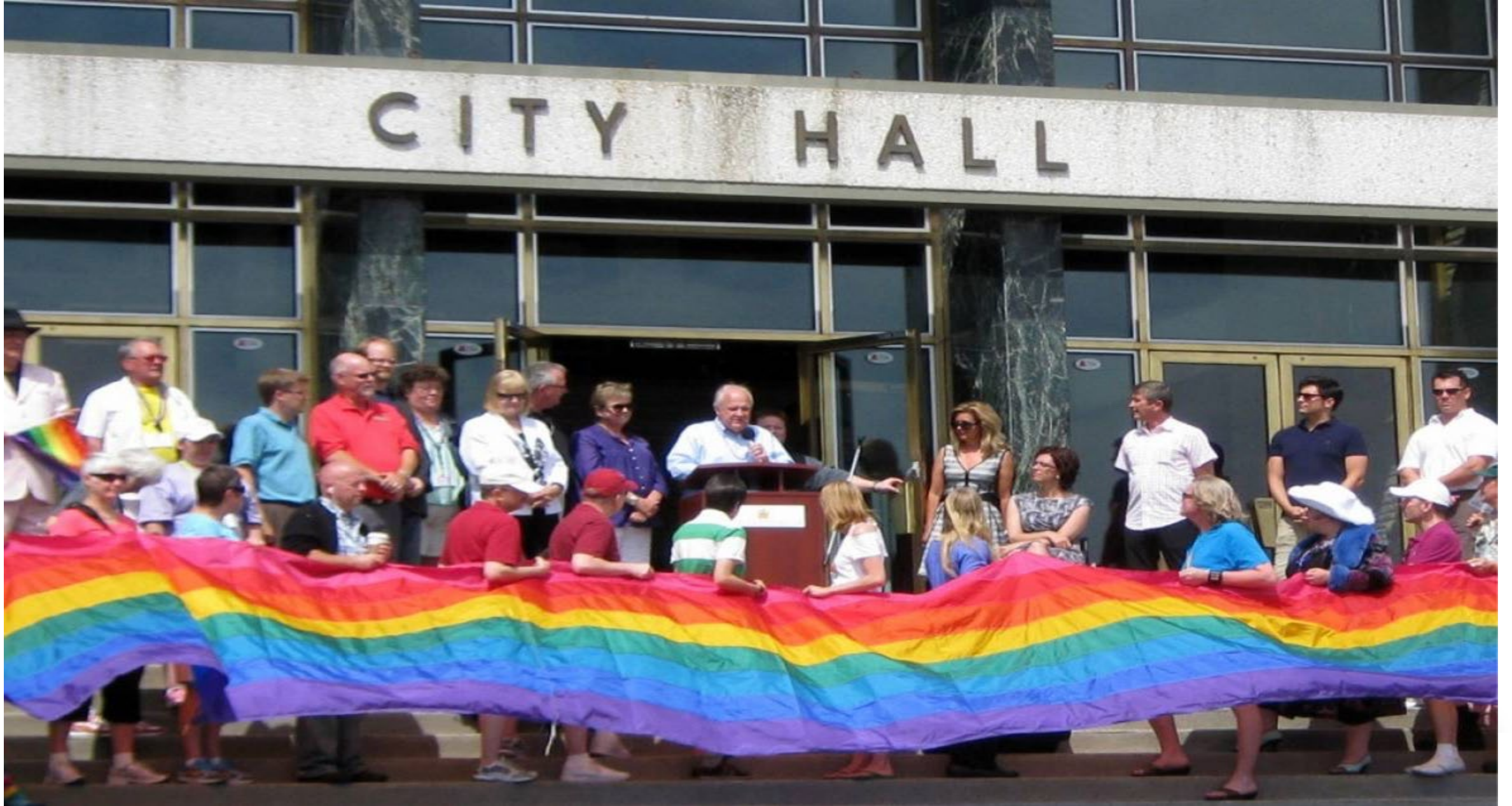
Category C: Awareness raising activities