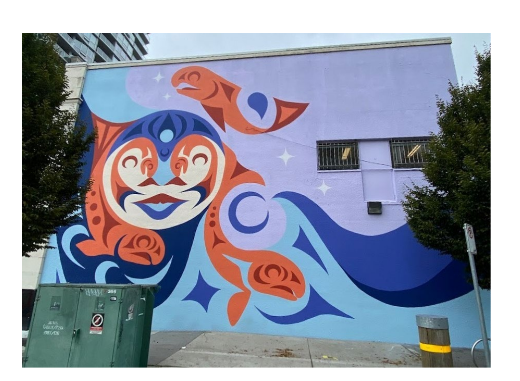
ARTS STRATEGY REFRESH & PUBLIC ART PLAN

Review of process tied to special events.