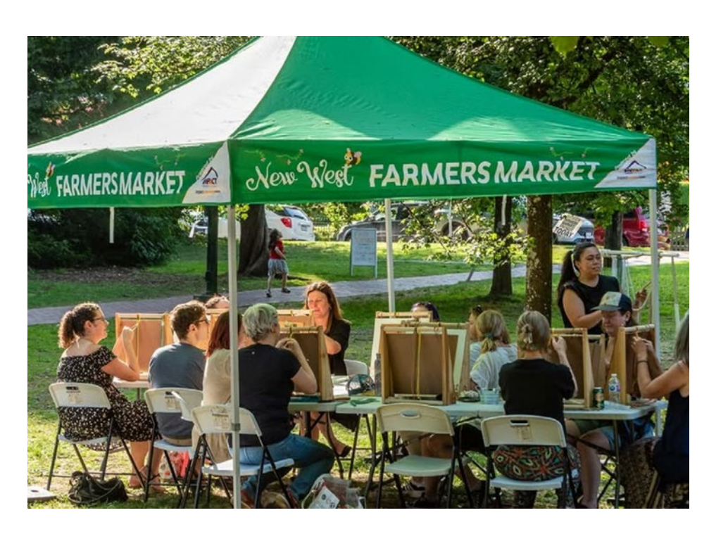
GRANT PROGRAM Continued implementation of undates to the

Continued implementation of updates to the grant program (phases 2 &3), pending resources.