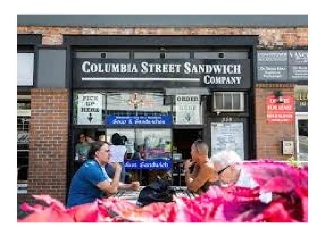
RETAIL STRATEGY UPDATES

Grants review update and proposed next steps.