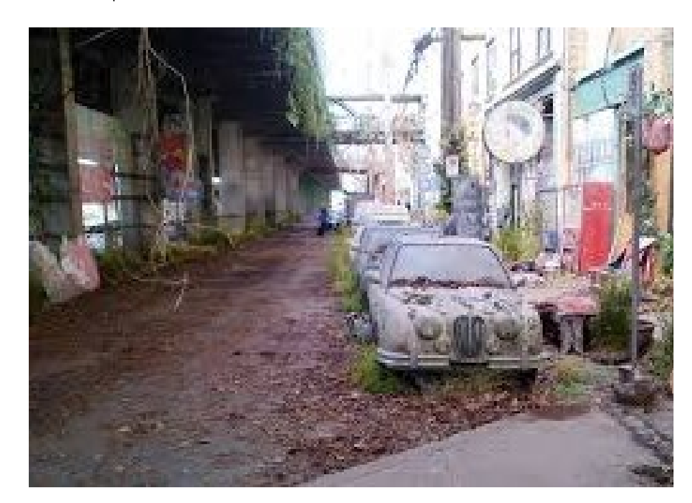
FILM OFFICE UPDATE

Shared recommendations in response to community/Council input provided through the 10 year review process.