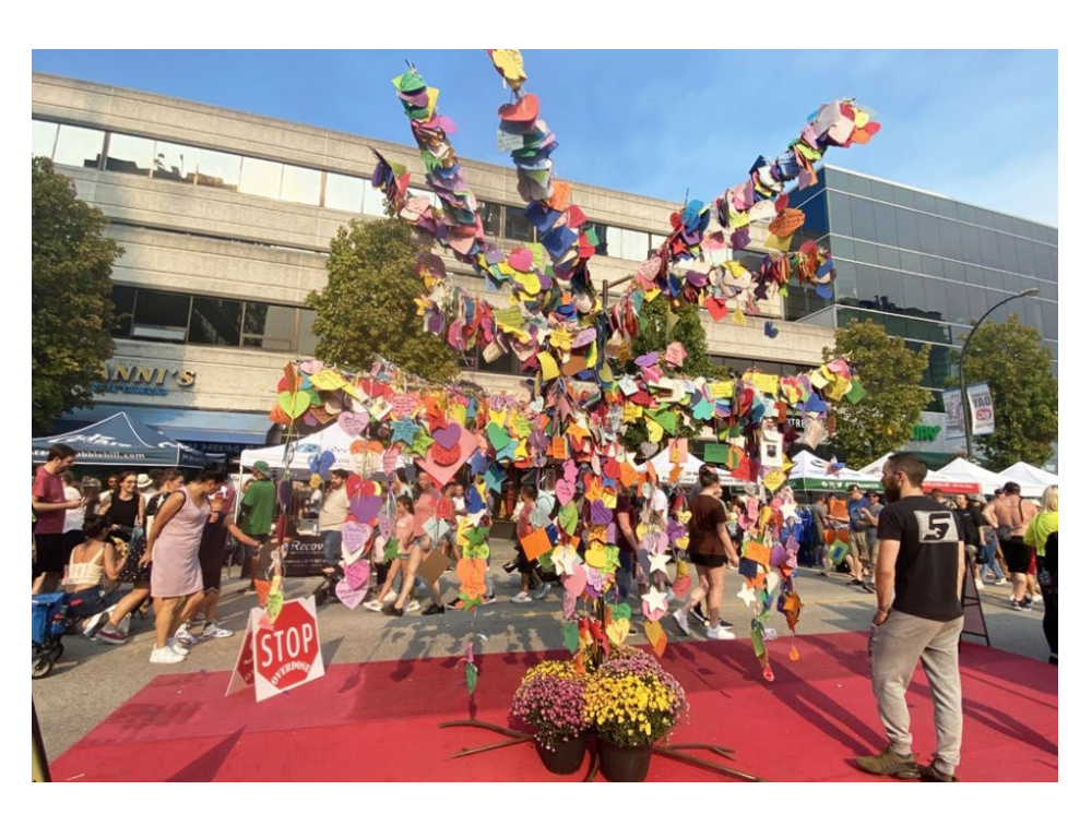
IMPROVED SPECIAL EVENTS & PROCESSES

Continued implementation of updates to the grant program (phases 2 &3), pending resources.