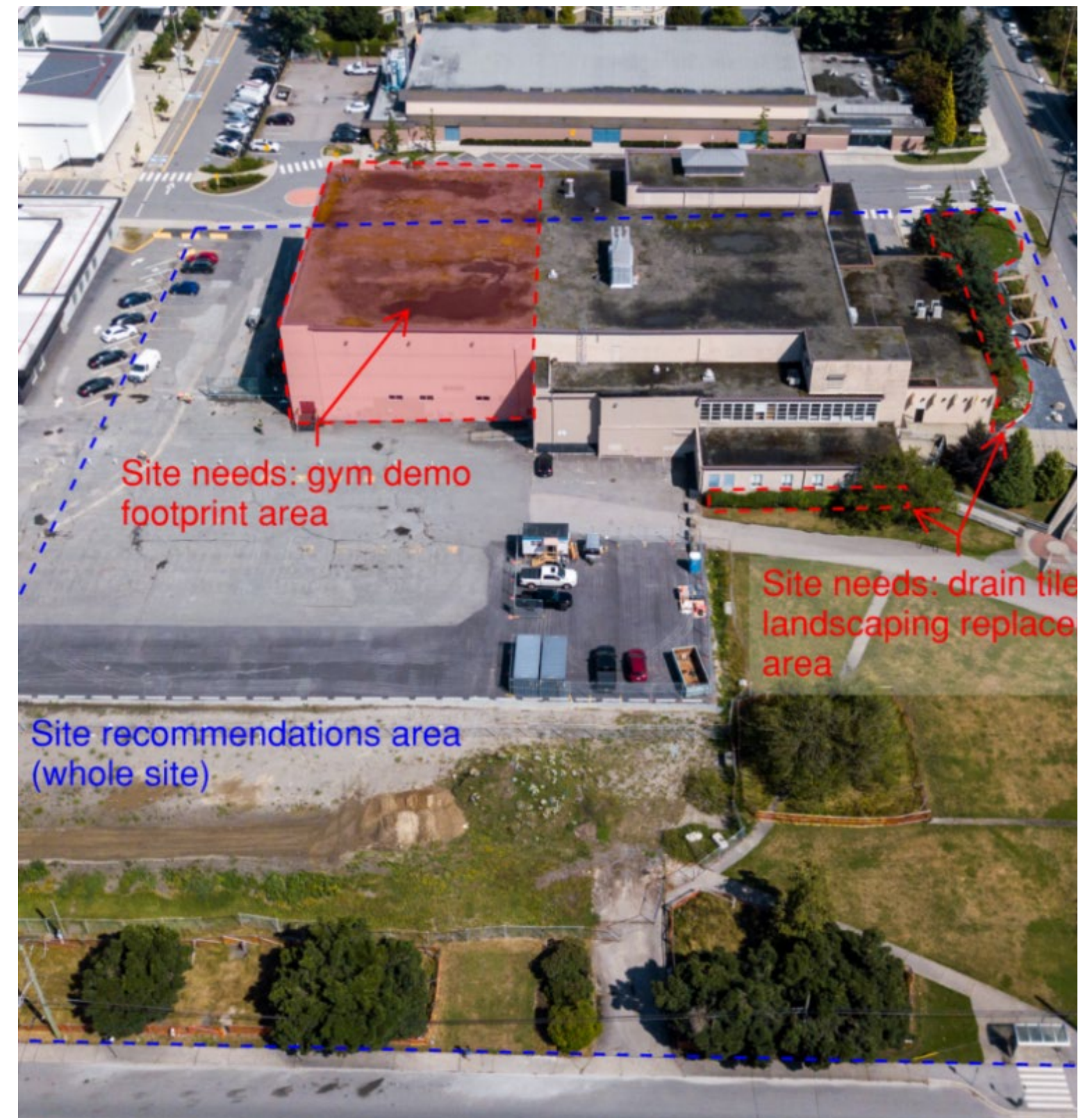
Public Realm Recommended Site Improvements and Minimum Site Needs