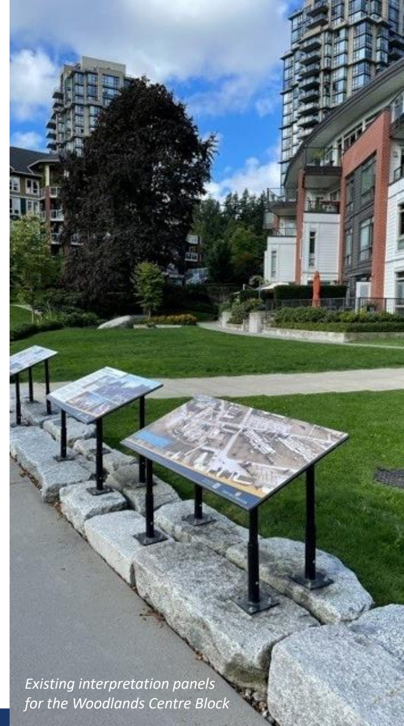
Existing interpretation panels for the Woodlands Centre Block