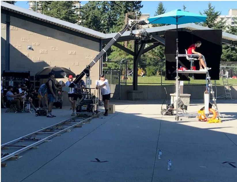
FILM TYPES 2024 (to October 1 2024)

The Film Office works with all types of commercial productions ranging from; feature films, television series & commercials, both student and independent films, music videos and photo shoots. The majority of the permits issued are for Television Series and Commercials.