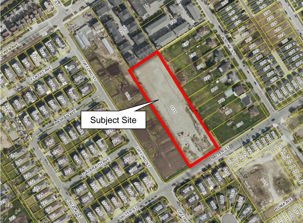
Figure 1. Site Context Map