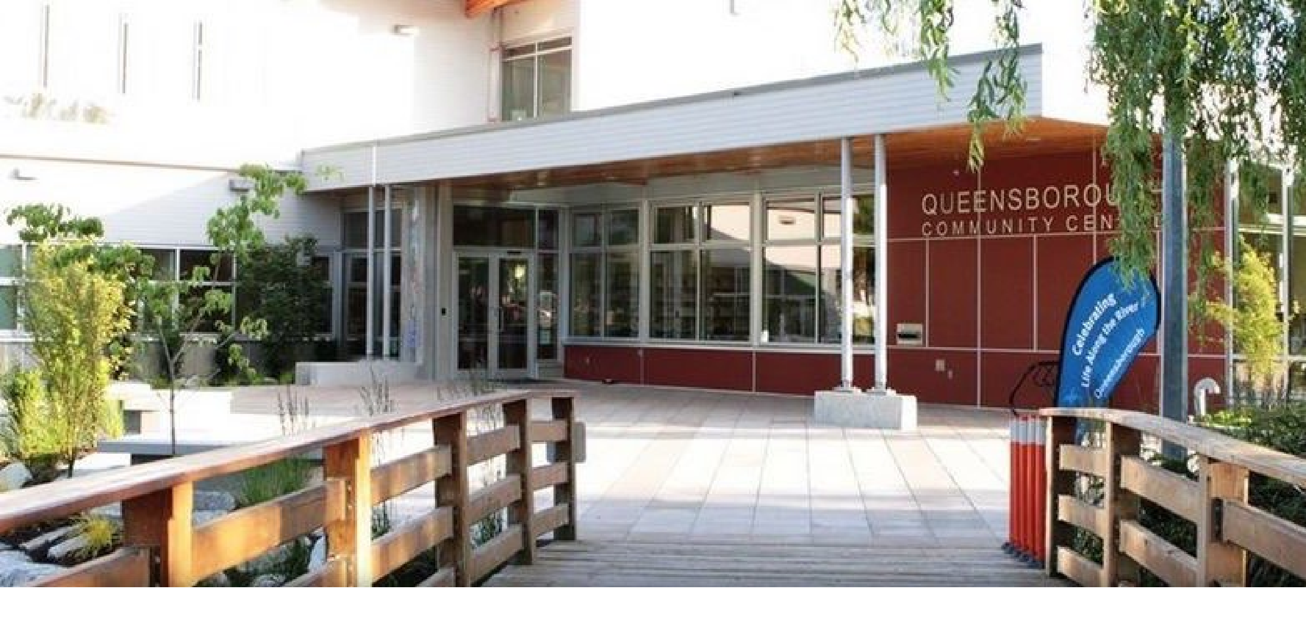
Theme 2: Expanding Facilities and Civic Spaces