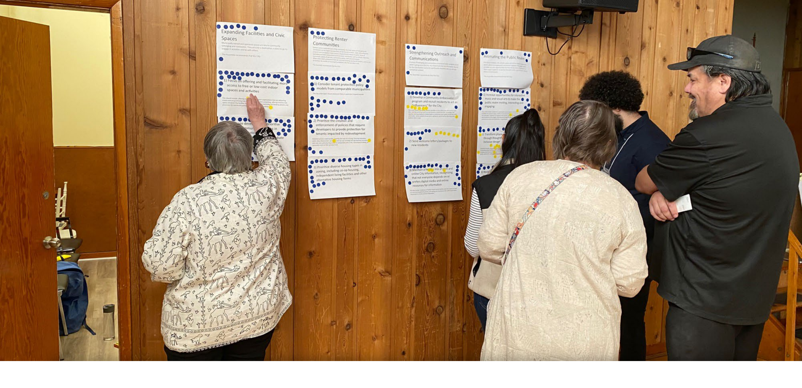
Theme 4: Strengthening Outreach and Communications