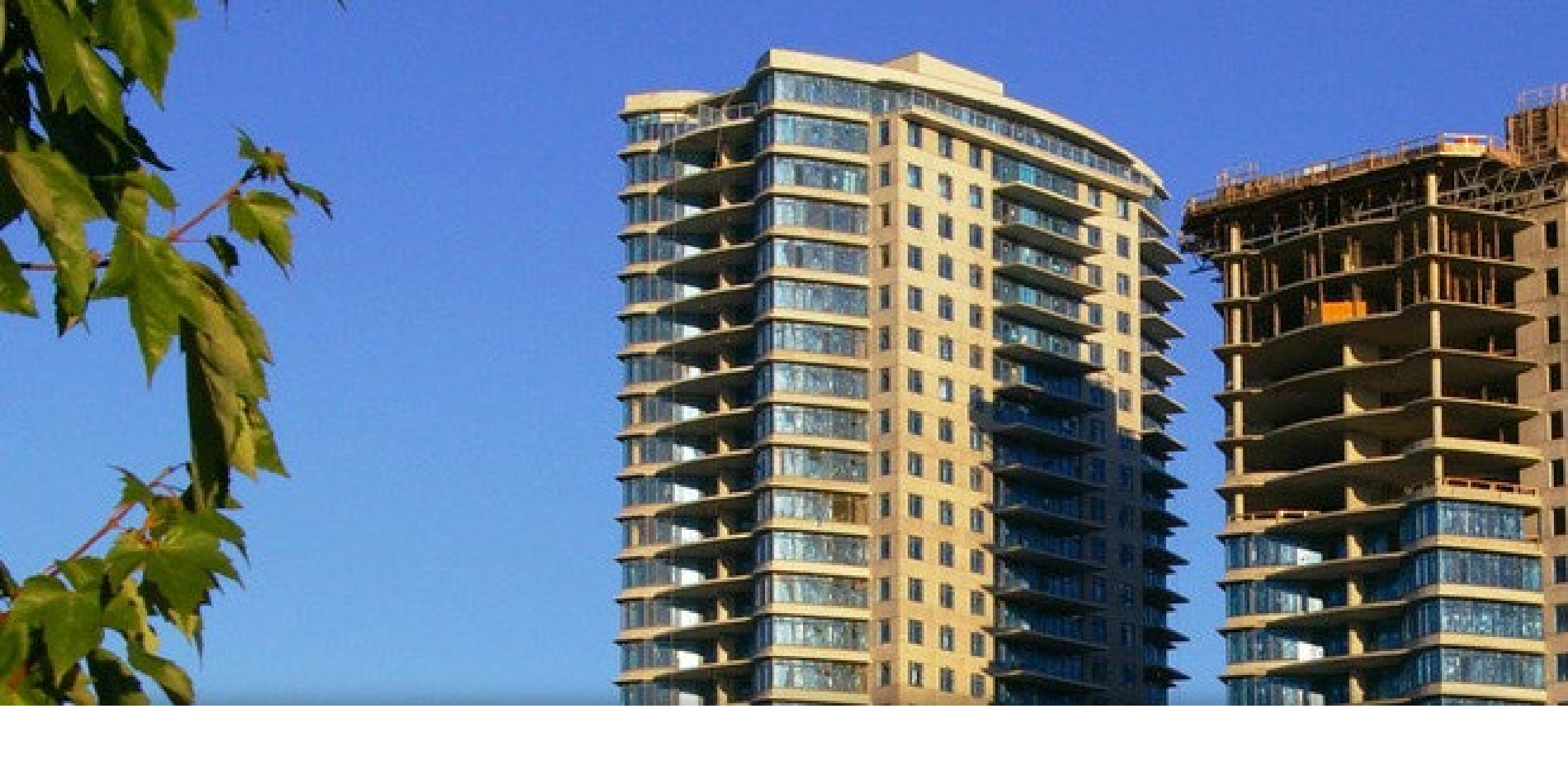
Theme 3: Protecting Renter Communities