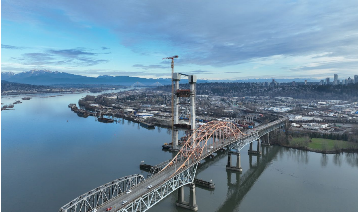
Above: Aerial of the new bridge tower looking toward Surrey.