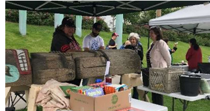
Restoration of Maquabeak Totem