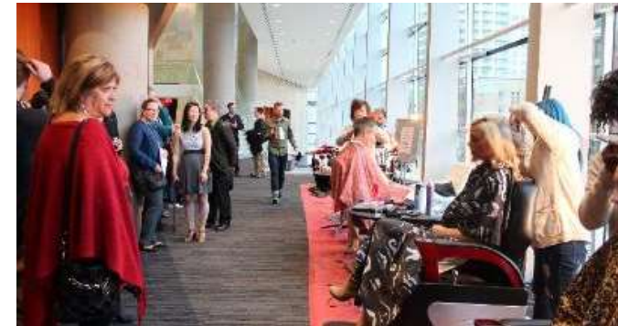
Vibe - Half Cut