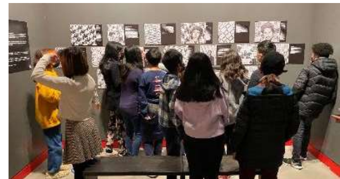
Black History Month Tessellation and Portraiture