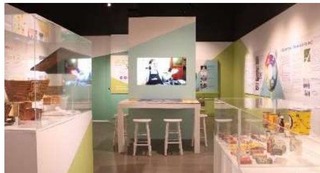
You Are What You Eat