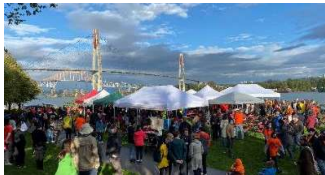
National Day For Truth and Reconciliation