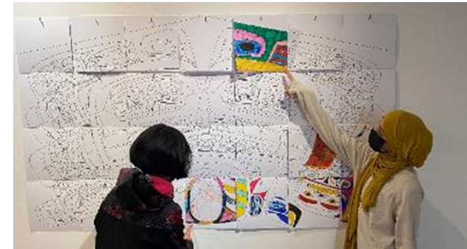
Neon Reconciliation Explosion Interactive