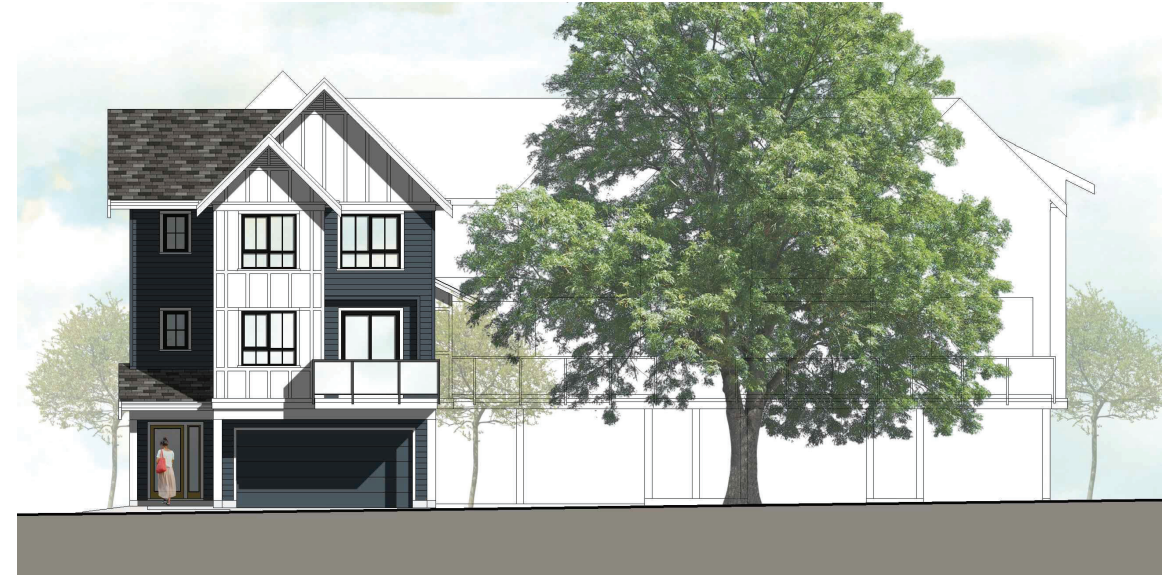
BUILDING A WEST ELEVATION