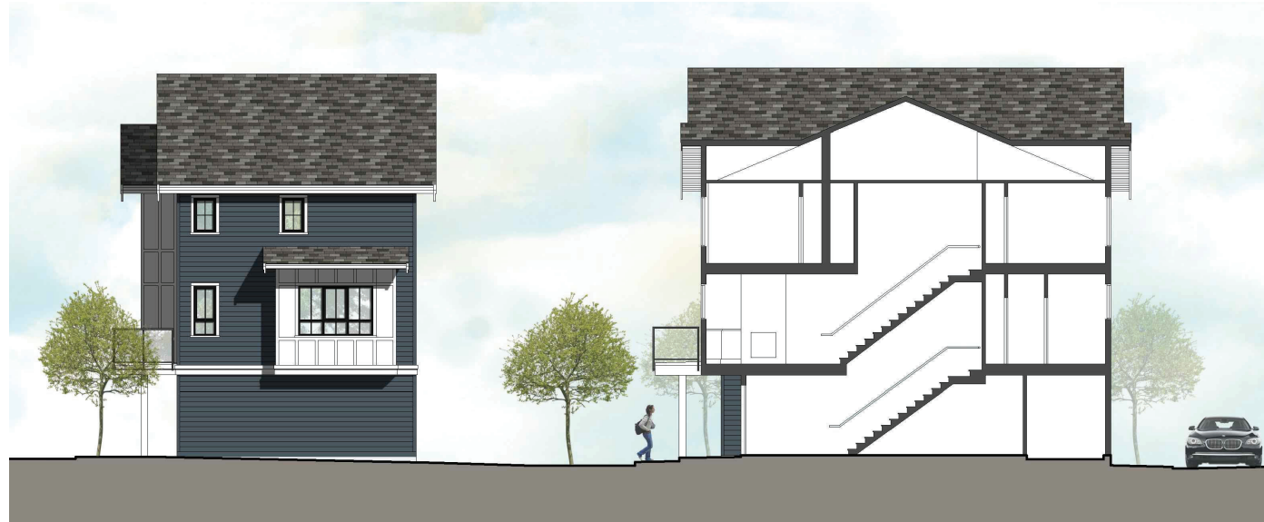
BUILDING A SOUTH ELEVATION - BUILDING B SECTION 3