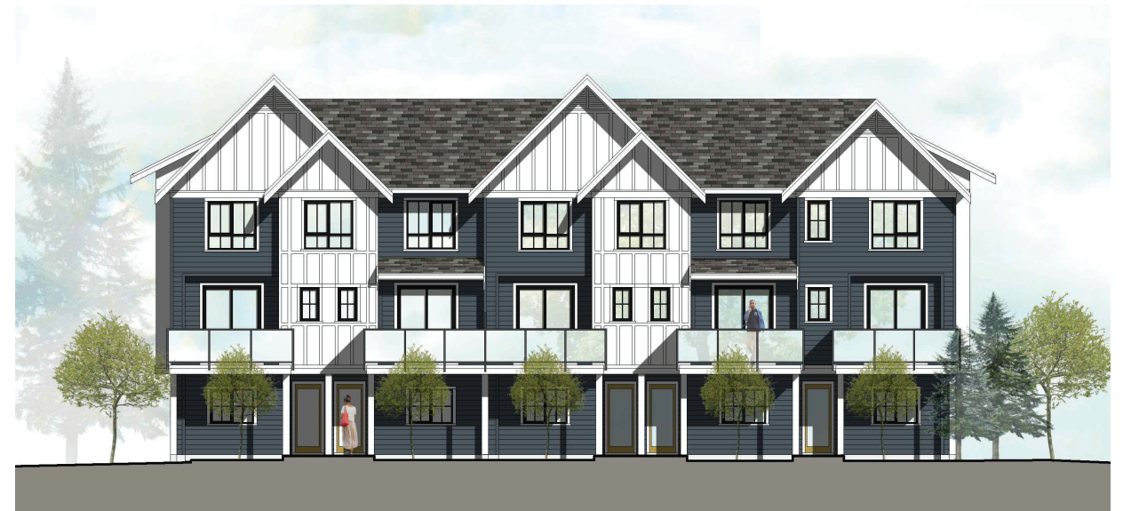
BUILDING B WEST ELEVATION