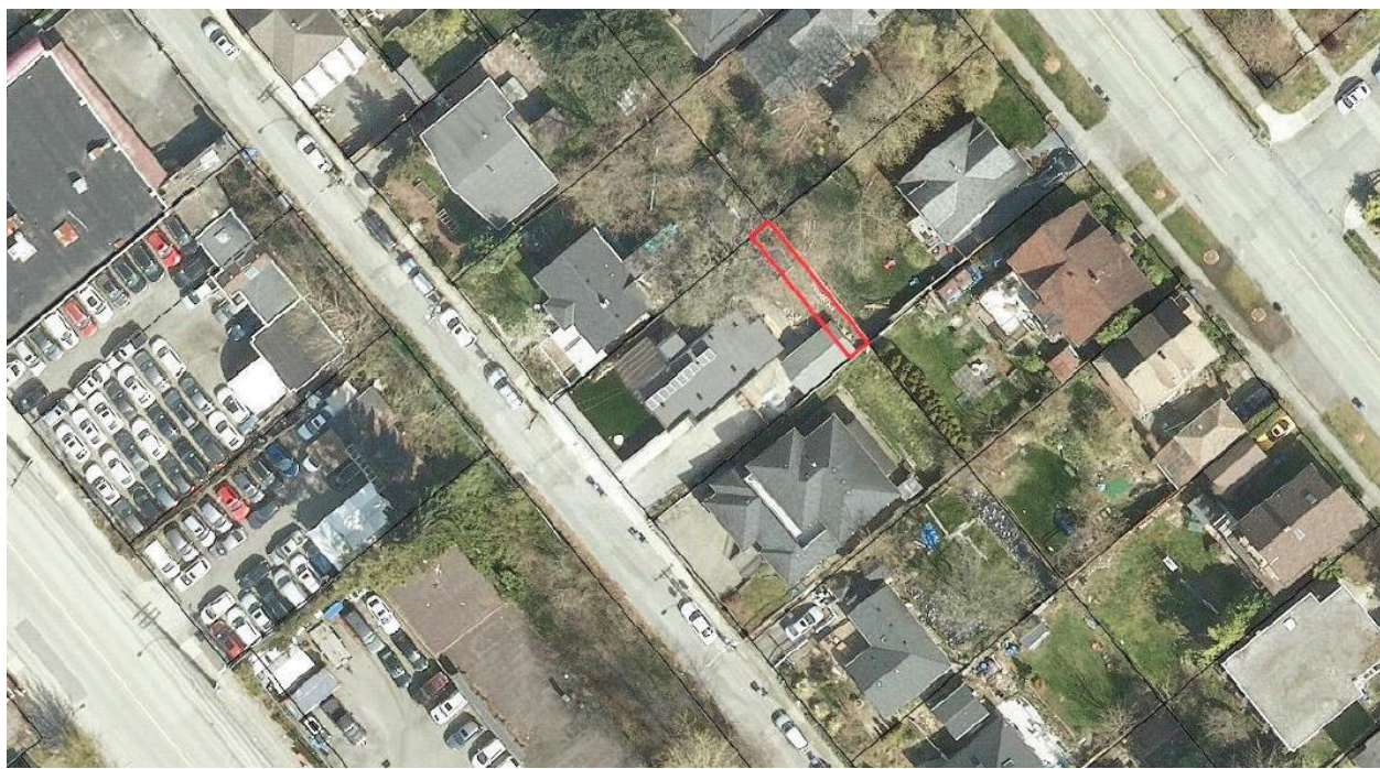
Figure 1: Aerial View of Subject City Property