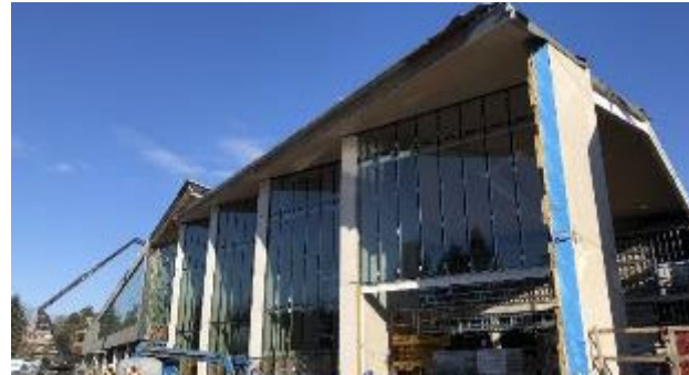
LONG-TERM FINANCIAL PLANNING AND RESILIENCE