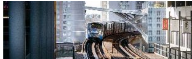
MORE HOMES NEAR TRANSIT