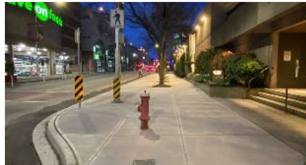
STRATEGIC INFRASTRUCTURE INVESTMENTS