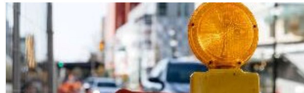
BUILD MORE HOMES FASTER