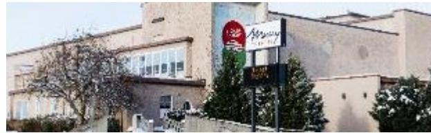
THE ROLE OF CULTURE