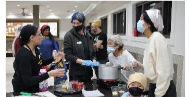
GREATER AWARENESS AND APPRECIATION