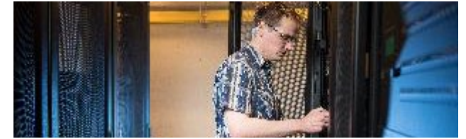
HIGH QUALITY JOBS