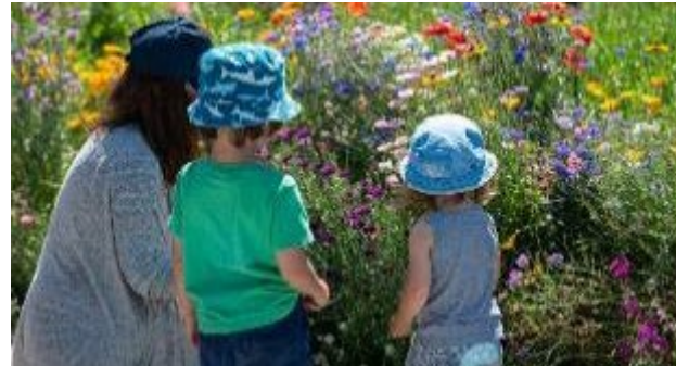
BELONGING AND CONNECTEDNESS

New Westminster is a community where everyone belongs and has opportunity to connect and contribute.