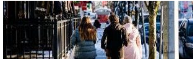
ACTIVE COMMERCIAL AREAS

A local, nimble, resilient economy that serves our local community.