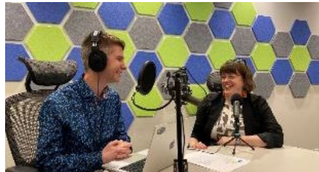
NEW AND GROWING CONNECTIONS