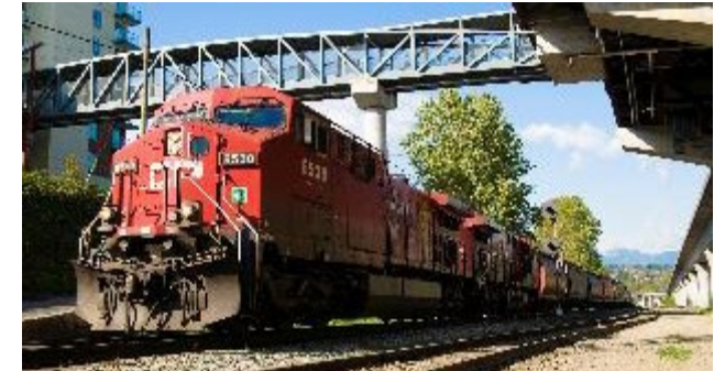
SAFETY GOVERNANCE AND MATURITY