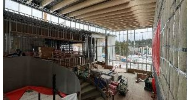
SUSTAINABLE SERVICE DELIVERY

Resilient infrastructure that meets the community's needs today and into the future.