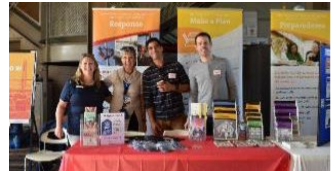
CITY SERVICES ALIGNMENT AND SUPPORT