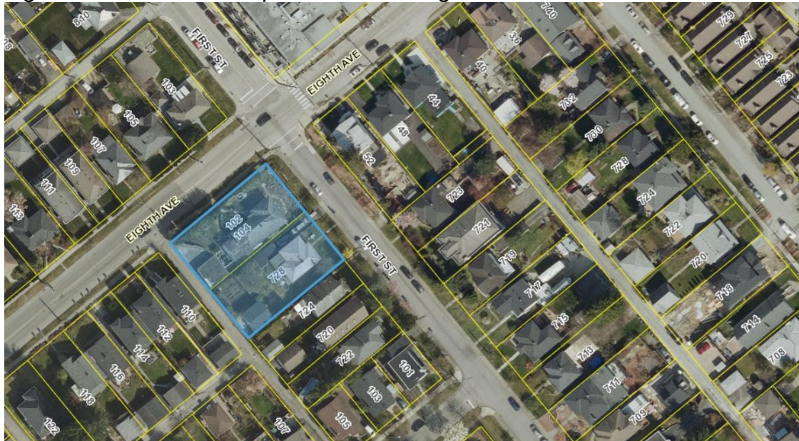
Figure 1: Site Context Map with 102/104 Eighth Avenue and 728 First Street in blue

The majority of properties surrounding the site are designated RD, with the low-rise apartment building to the north designated Residential – Multiple Unit Buildings (RM). The site is approximately one block west of Royal Square Mall and Terry Hughes Park, and less than 400 m. from Herbert Spencer Elementary School, Glenbrook Middle School, and Queen's Park. A site context map and aerial image is provided below: