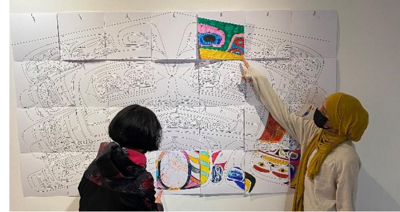
Neon Reconciliation Explosion Interactive