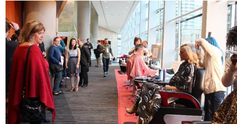
Vibe - Half Cut