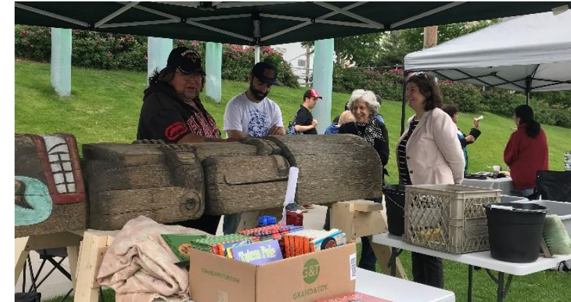
Restoration of Maquabeak Totem