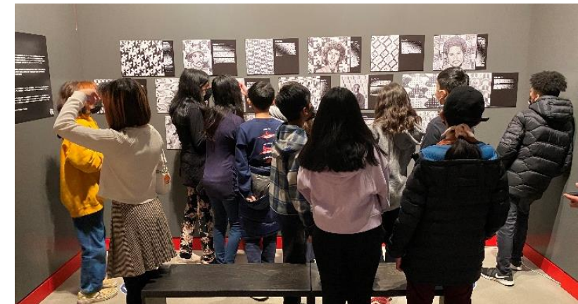
Black History Month Tessellation and Portraiture