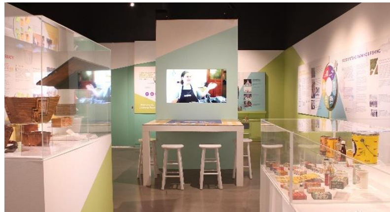
You Are What You Eat