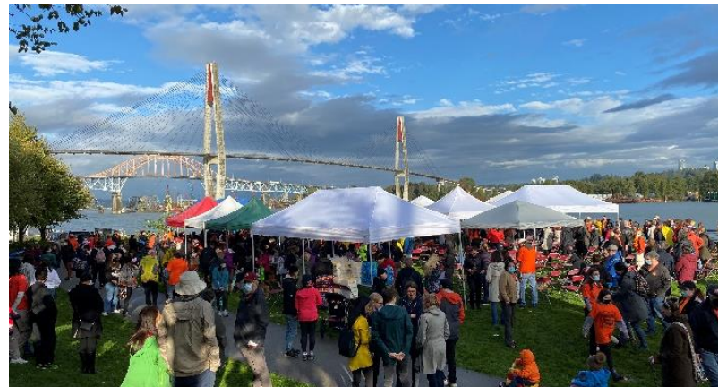
National Day For Truth and Reconciliation