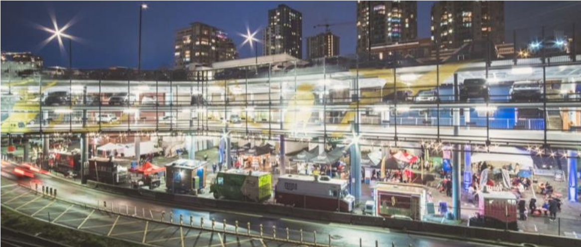
Figure 2. Image- Fridays on Front Holiday Edition (2018)

The majority of the improvements along the eastern portion of the mews were temporary in nature while a larger, more permanent plan was under development. The installation of the improvements (i.e. temporary stairs, catenary lighting, mega banners, large-scale mural and street paint) was timely as part of the City’s efforts to support the ‘Friday’s on Front Holiday Edition’ market. This seasonal event was hosted under the parkade by the Downtown Business Improvement Association (DBIA) in December 2018 (refer to Figure 2 below) and was successful in showcasing how this unique covered space may be utilized for programming and community events.