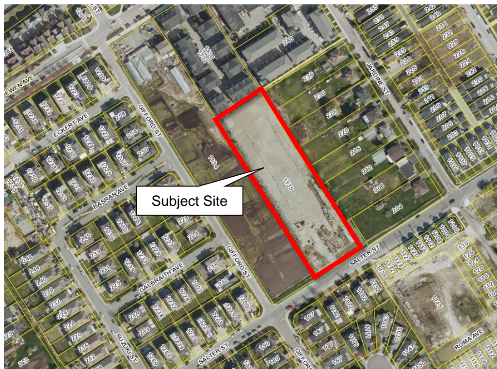
Figure 1. Site Context Map

The site is subject to floodplain constraints on the amount of floor space at grade and the use of that floor space. No storage or habitable floor space is allowed below the flood construction level of 3.53 m. (11.58 ft.) Geodetic Survey of Canada (GSC). The underside of the floor system for habitable space must be at or above this level. A site context map is provided below (Figure 1).