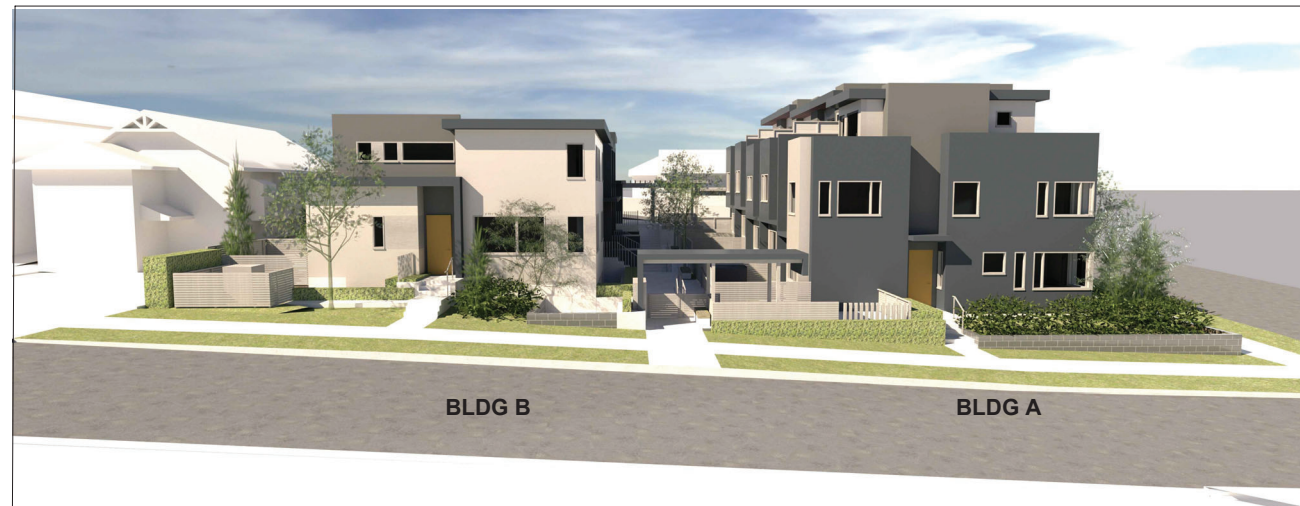
BLDG A BLDG B LANE ELEVATION