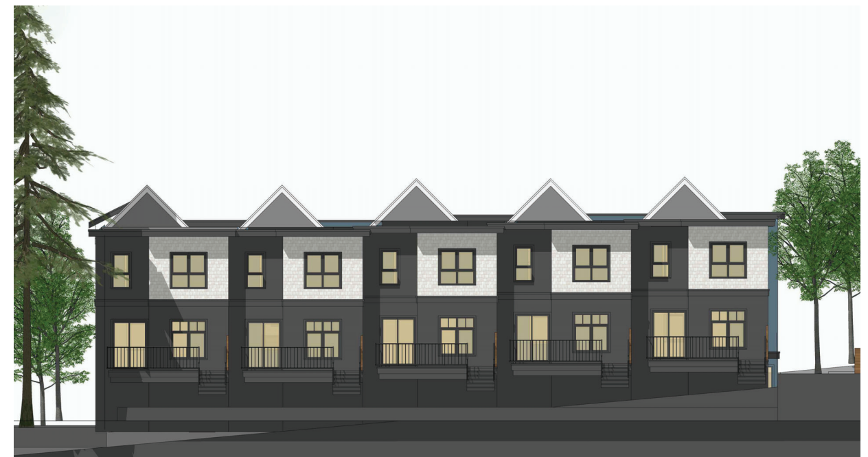
BUILDING 2 NORTH ELEVATION