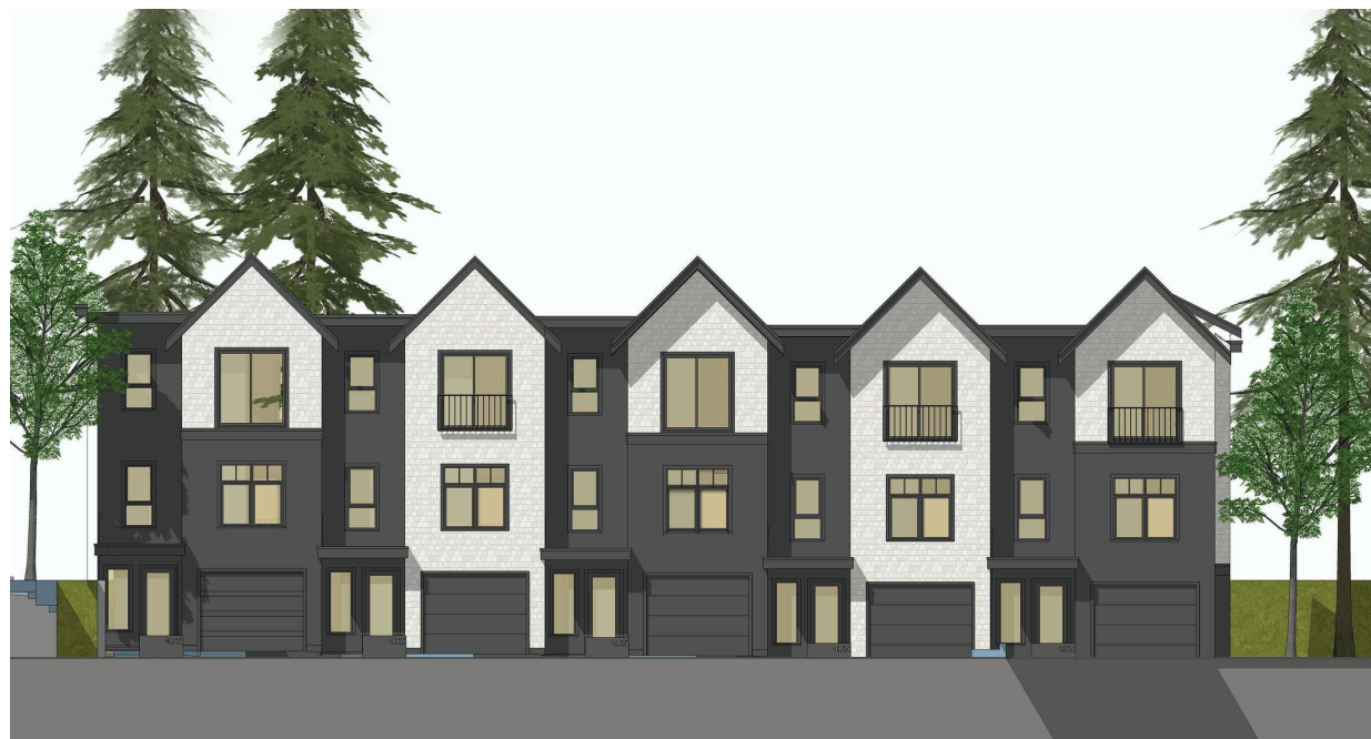
BUILDING 2 SOUTH ELEVATION