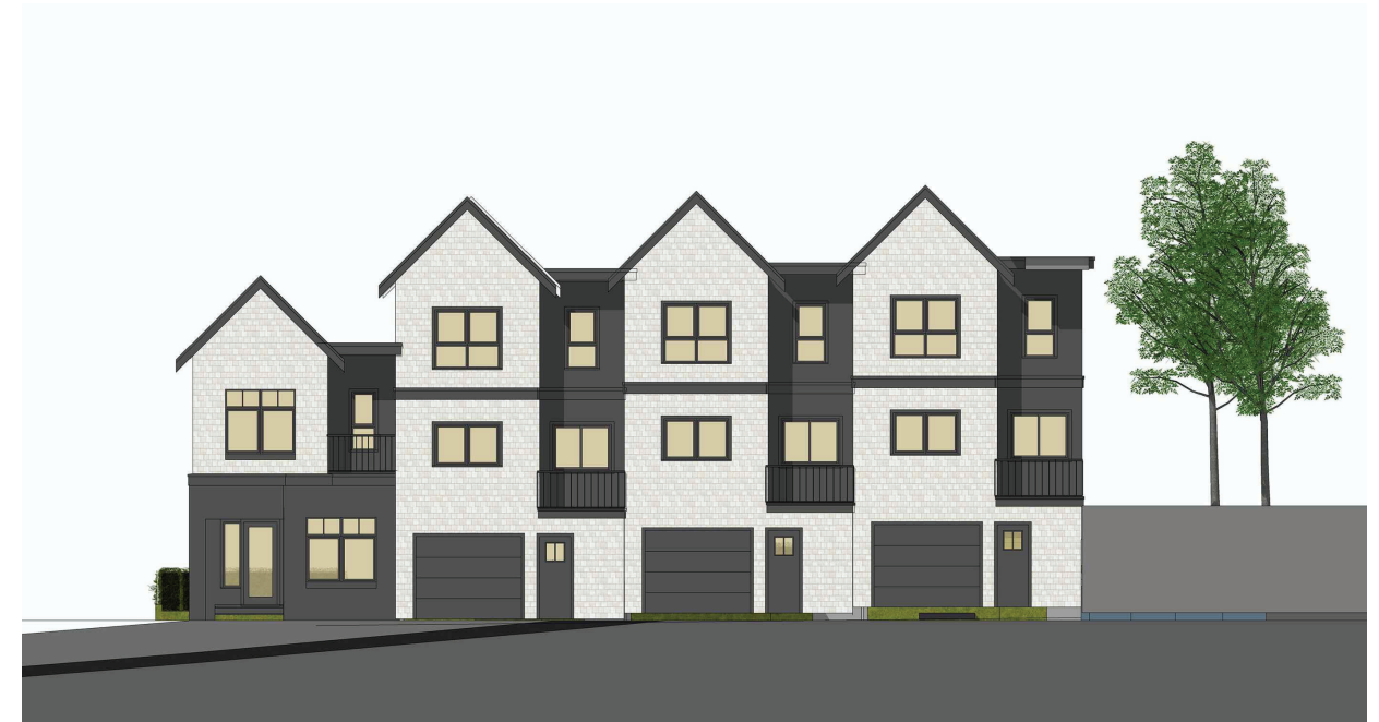
BUILDING 1 NORTH ELEVATION