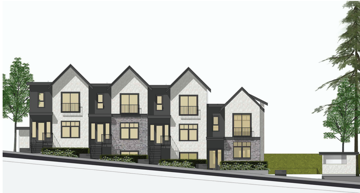
BUILDING 1 SOUTH ELEVATION