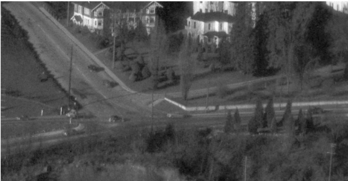
Photo B-6: 1951 oblique aerial with gate columns removed.