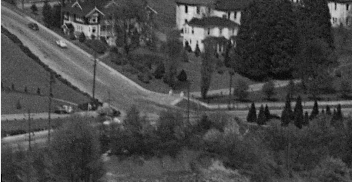
Photo B-5: 1948 oblique aerial with gate columns visible.