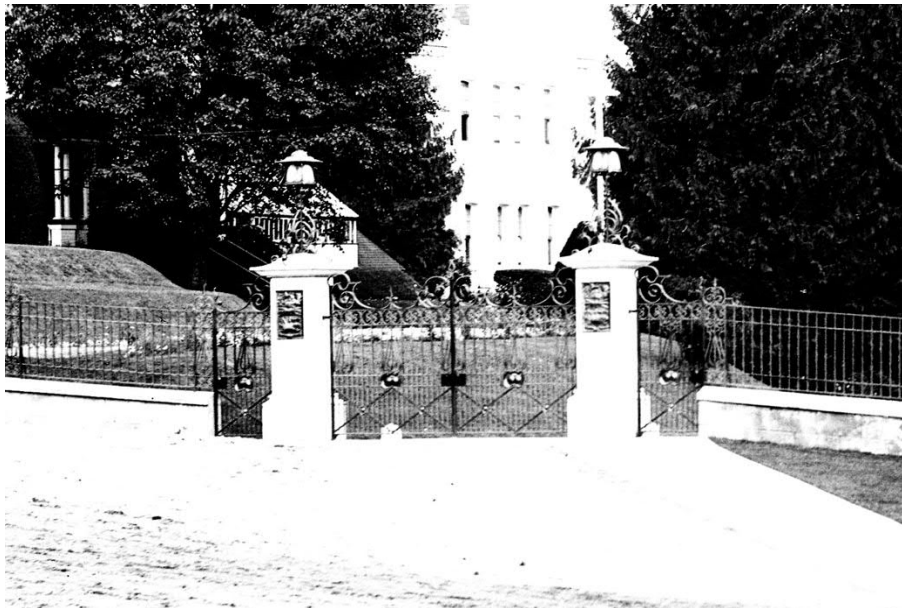
Photo B-2: Detail of Woodlands Wall gate columns, 1909.