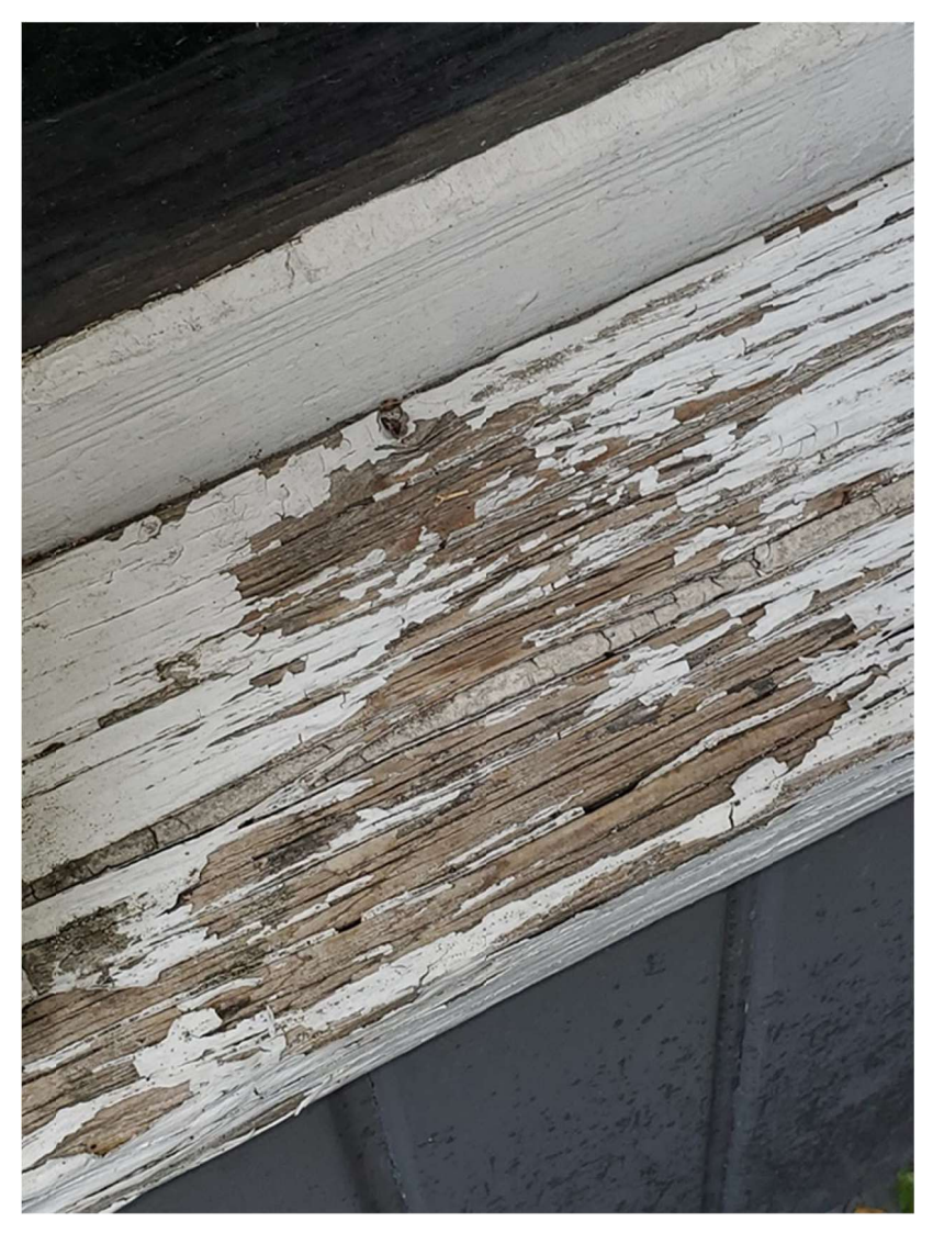
503 most wood windows beyond repair, fully decayed