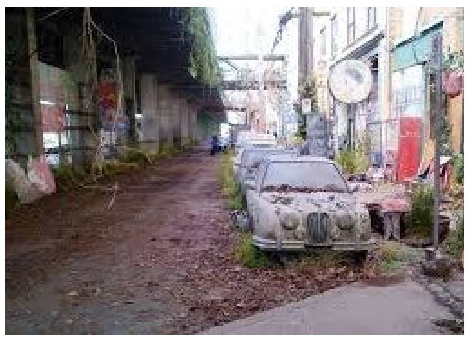
FILM OFFICE UPDATE

Shared recommendations in response to community/Council input provided through the 10 year review process.